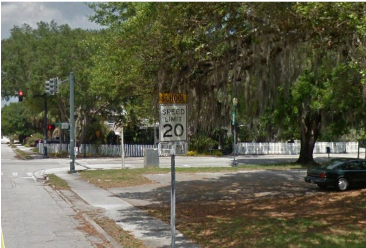
Corner of S 10th St and Delaware Ave - Existing Picket Fence