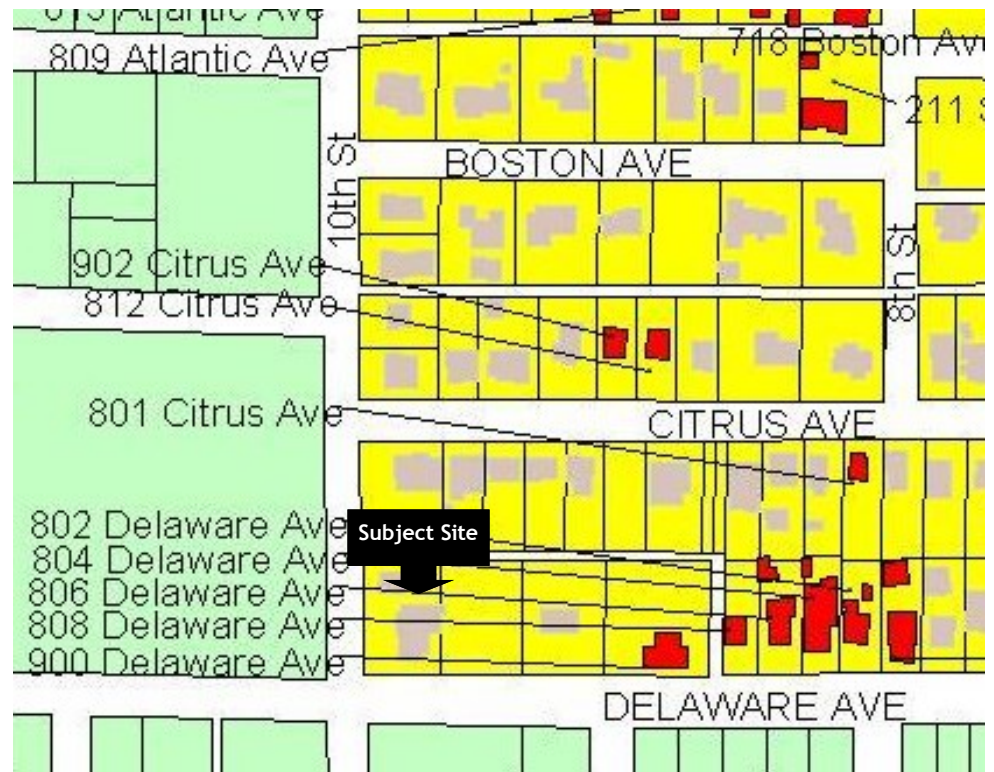
Location Map ■ Contributing ■ Non-Contributing ↑ Subject Site