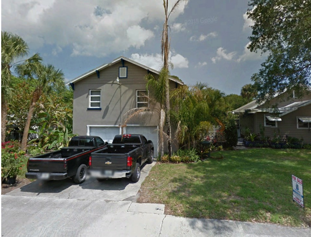
10th Street View