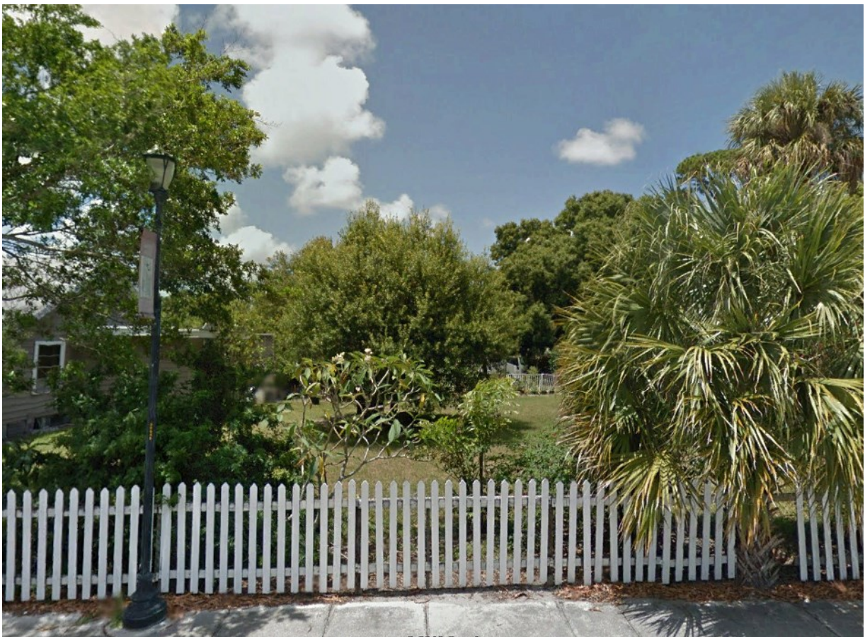
Delaware Avenue View

Staff also recommends that the existing white picket fence be restored and maintained as it blends nicely with the existing environment and does not detract from the character of the historic structures within the Sample Oaks Historic District.