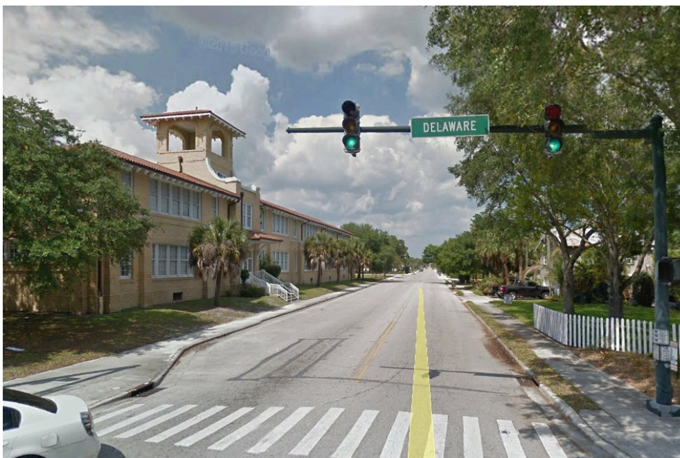
10th Street Perspective View