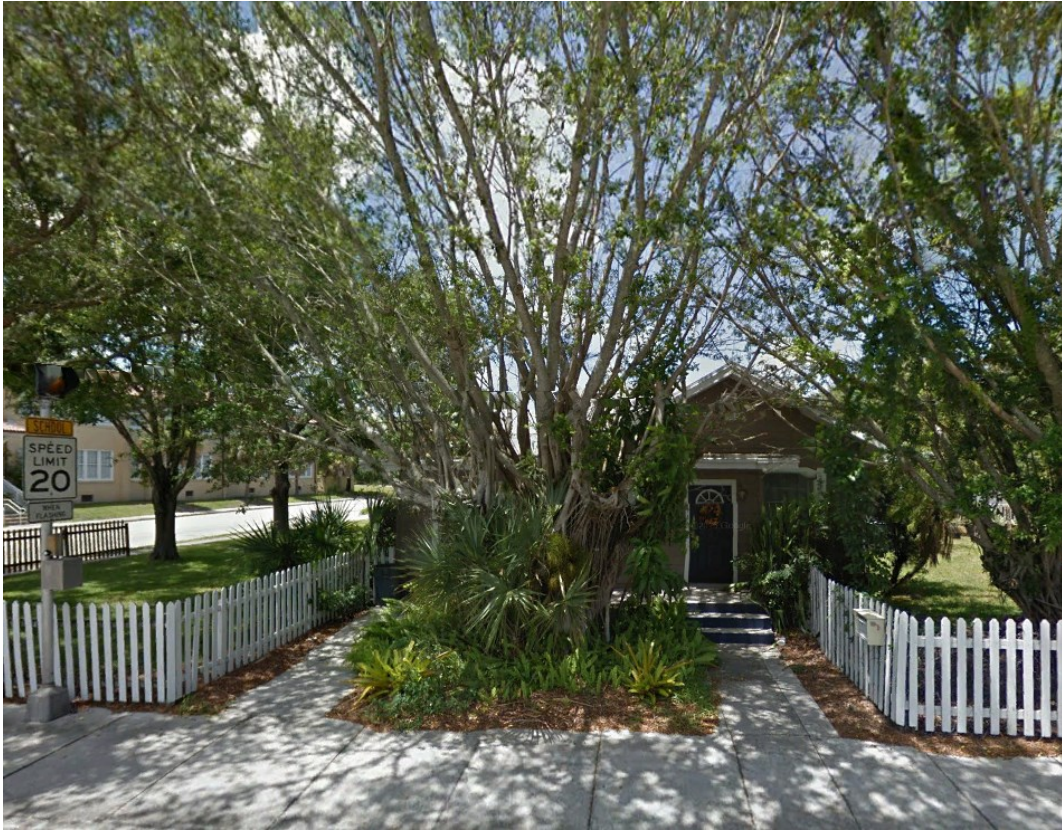
Delaware Avenue View