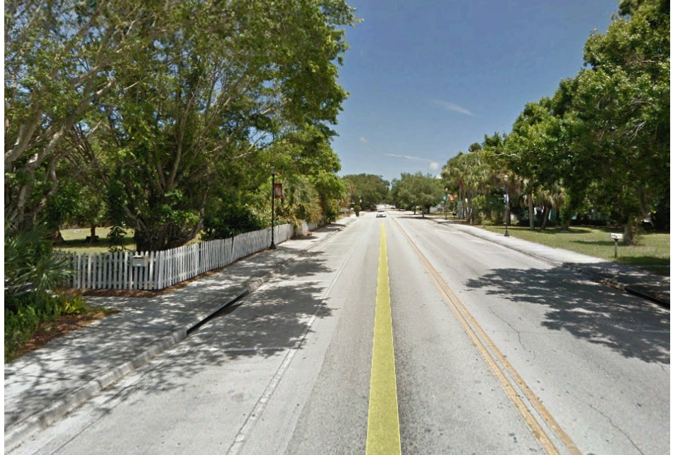
Delaware Avenue Perspective View