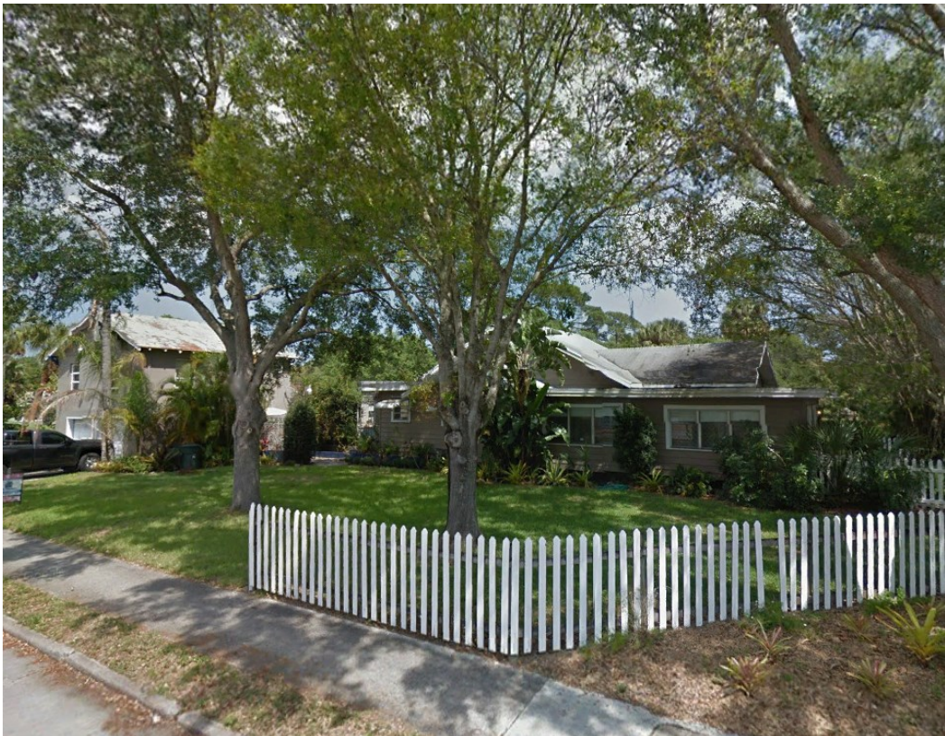
10th Street View