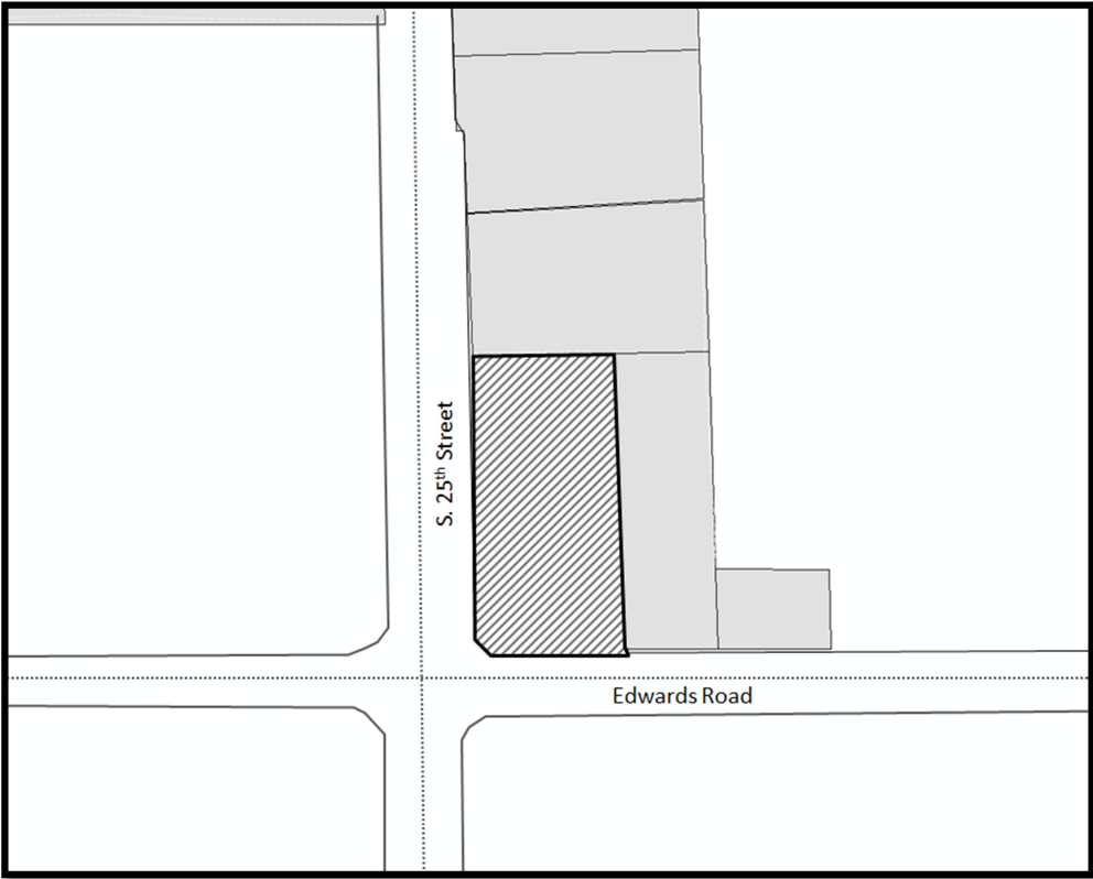
EXHIBIT A Territorial Limits Extension