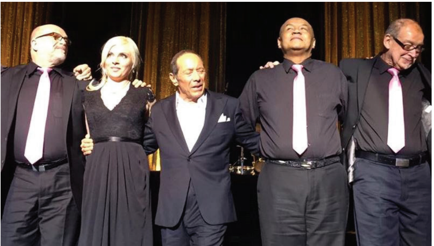
▲ Paul Anka and friends