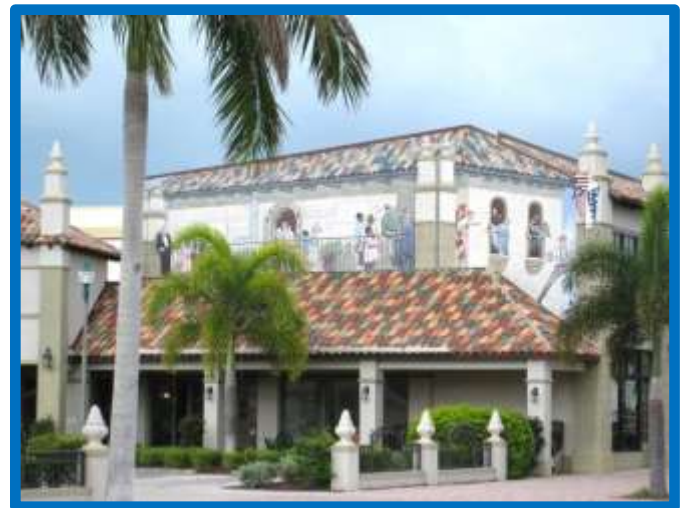
Historic Arcade Building - Downtown Fort Pierce

The Division of Arts and Culture will direct, with extensive citizen, artist, arts organization, City Commission, Advisory Board and staff input, the creation, development and implementation of the City's Arts and Culture Strategic Plan, which will include guidelines, ideas for programs, projects and services to support, preserve and strengthen Fort Pierce's existing arts and cultural heritage amenities and its diverse artistic community.