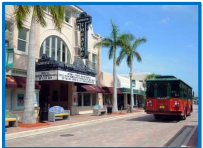
Historic Sunrise Theater for the Performing Arts Downtown Fort Pierce