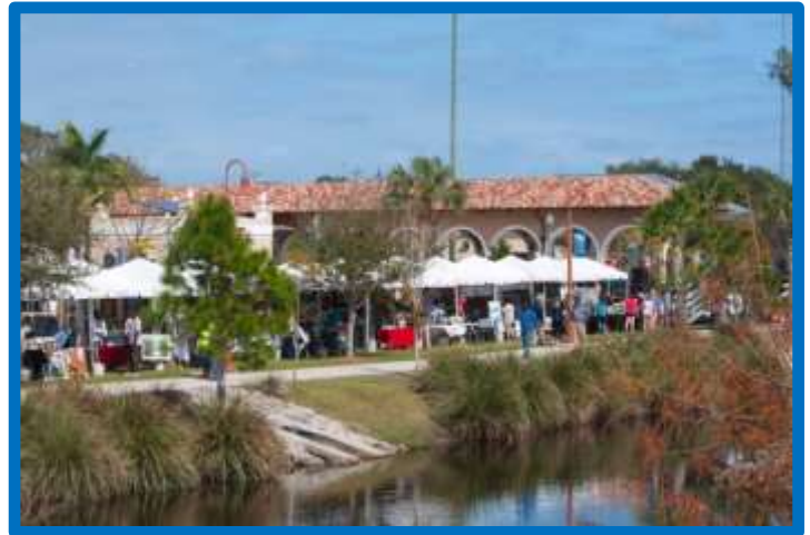
Annual Highwaymen Heritage Trail Art Show and Festival Moore’s Creek Linear Park – Lincoln Park Neighborhood