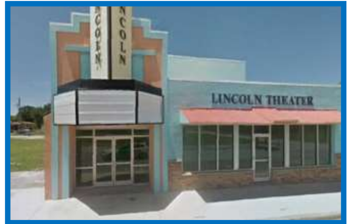
Historic Lincoln Theater Avenue D – Lincoln Park Neighborhood

Note: Public art, including street art, murals, etc. create and encourage a ‘following’.