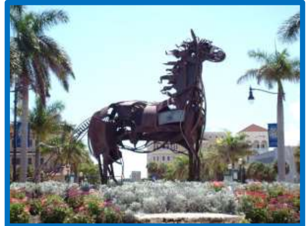
"Away" – Downtown Fort Pierce