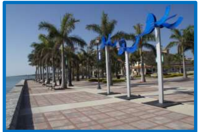
“In the Swim” – Downtown Fort Pierce

Note: Schools like Chester A. Moore Elementary that are currently without an art teacher or art department and recently received an “F” score from the Department of Education should be a primary focus.