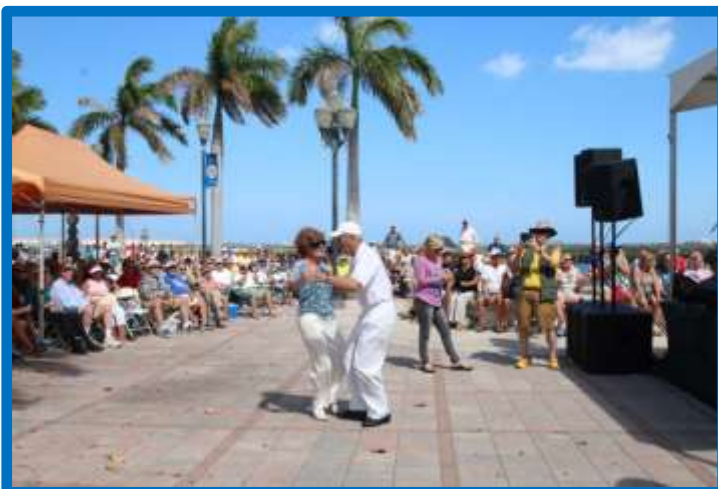
Jazz and Blues Society – Outdoor Concert – Downtown Fort Pierce