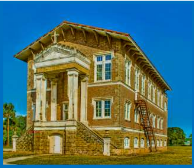
Historic St. Anastasia Building 910 Orange Avenue – Fort Pierce

The historic St. Anastasia building – 910 Orange Avenue. Collaborate with St. Lucie County to relocate the St. Lucie County Regional History Center to the