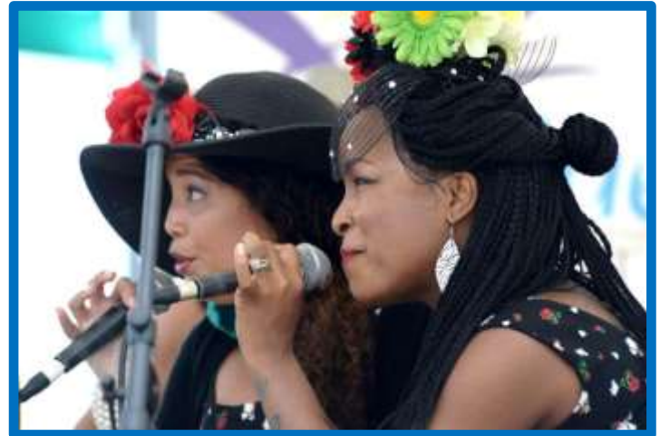
Jazz and Blues Fest – Downtown Fort Pierce