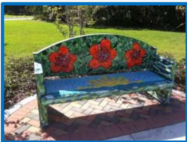
One of many concrete benches adorned with brightly-colored mosaic art in Fort Pierce

Across sectors and at all levels, today’s leaders and policymakers are increasingly recognizing how arts-based Creative Placemaking initiatives can simultaneously advance their missions in transportation, housing, employment, health care, environmental sustainability, and education.