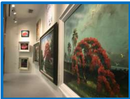
Annual Highwaymen Art Exhibit Fort Pierce City Hall

Creativity is a powerful economic engine for Fort Pierce. The creative sector contributes directly and indirectly to community prosperity, by generating economic activity, providing employment, making our city attractive, and enhancing our overall quality of life.