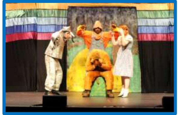
The Wizard of Oz – Missoula Children's Theater Summer Camp – Sunrise Theater - 2013

Creativity – Creativity is participation in a range of activities that allow for imaginative expression, such as music, art, creative movement, and drama, which engage the mind, body and senses.