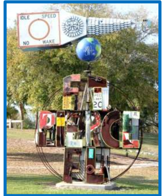
“The Art of Living Green” – Downtown Fort Pierce