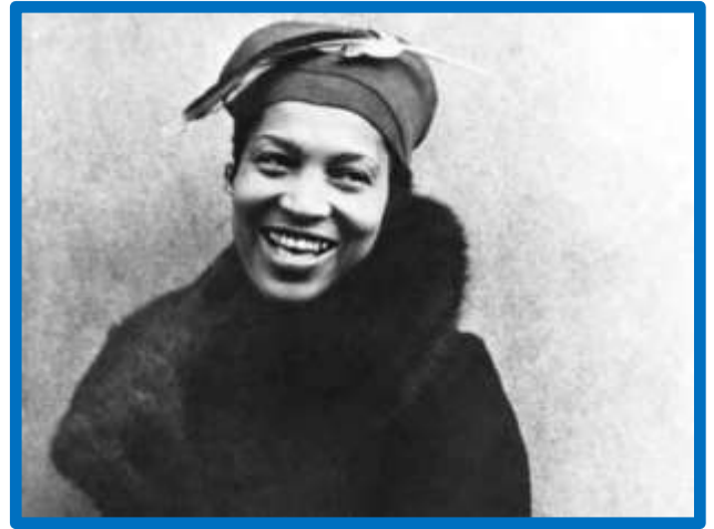
Zora Neale Hurston