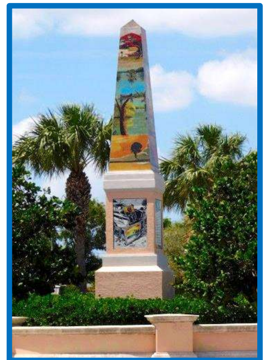
Highwaymen Obelisk Highwaymen Heritage Trail Stop #7 Avenue D and 15 th Street

Note: The process to disseminate City and County AIPP funding for sub-awards for Fort Pierce-based arts and cultural heritage projects will be accomplished the same way the Department of Urban Redevelopment provides dozens of grant awards for public service and commercial façade improvements each year. This process includes: a competitive grant application process with review of applications and recommendations for funding of individual projects by an advisory board with final determination by the Fort Pierce City Commission. Following grant awards, grantees will be required to adhere to award contractual agreements, based