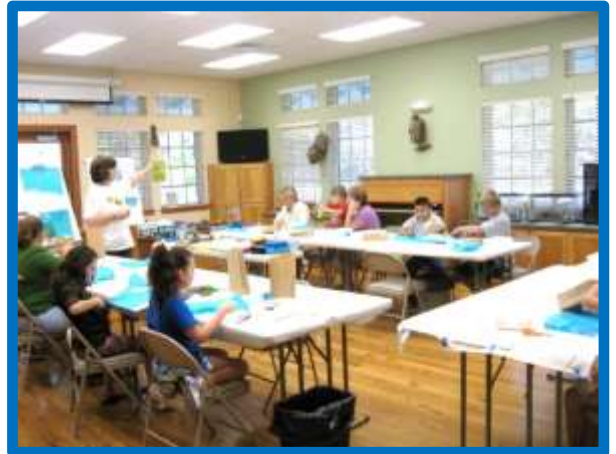
Summer Art Class Treasure Coast Art Association

End Result Positive, ongoing support for the development of arts and cultural heritage in Fort Pierce will increase economic vitality, investment, development, job creation, tourism, and quality of life, while enhancing artistic endeavors and encouraging academic growth through the arts.