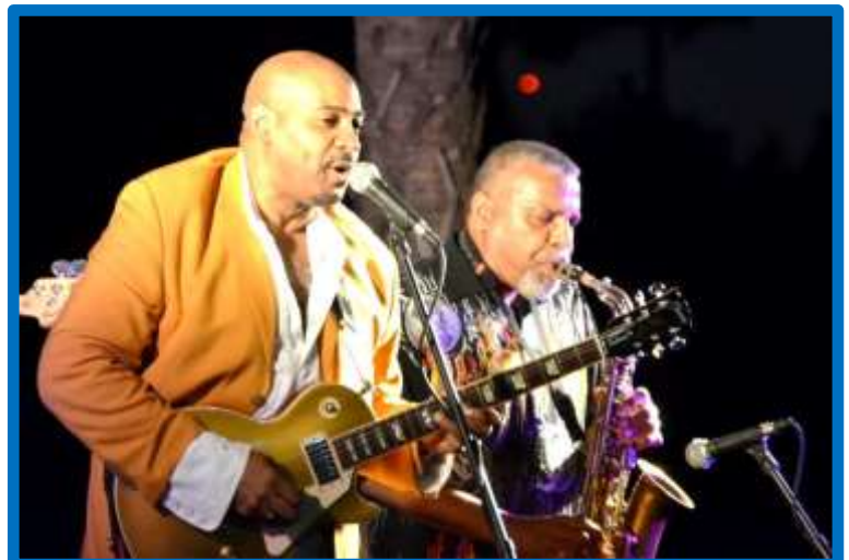
Quarterly ‘Jazz on Moores’ Creek’ Concert Moores’ Creek Linear Park – Lincoln Park Neighborhood

Note: Establishing an Arts and Cultural Heritage Center will qualify the City to apply for grants from multiple funders, since the space utilized for the Center can be used as ‘match’ for various state and national grants. Funders are more likely to award grants for programs that have an Arts and Culture Master Plan and a facility currently in use.