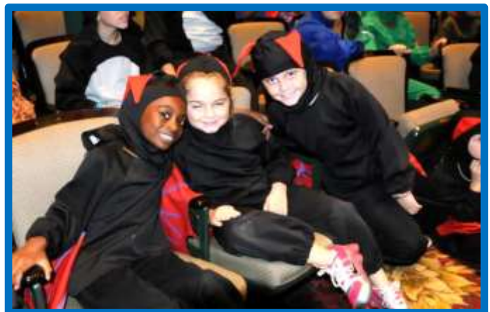
Missoula Children’s Theater Summer Camp - Sunrise Theater