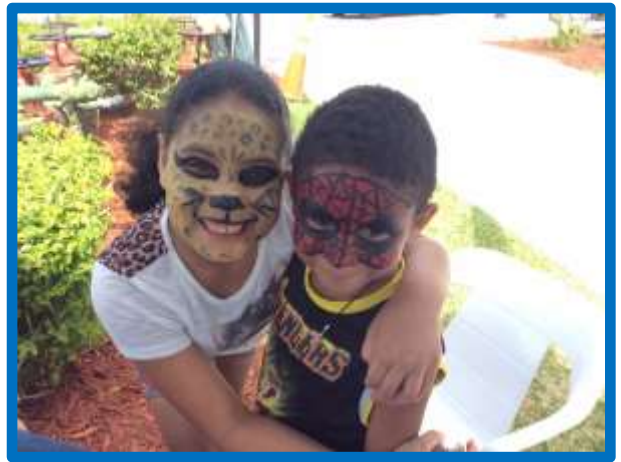
Hooked on Music Festival – Downtown Fort Pierce

The intention of the Strategic Plan is to provide a framework for the inclusion of public art and cultural heritage programming in the daily life of Fort Pierce, to reinforce community identity and change outsider perceptions, capitalize on local assets, spur economic development and job creation, increase tourism, create places for human interaction and assure the preservation of our local cultural heritage.