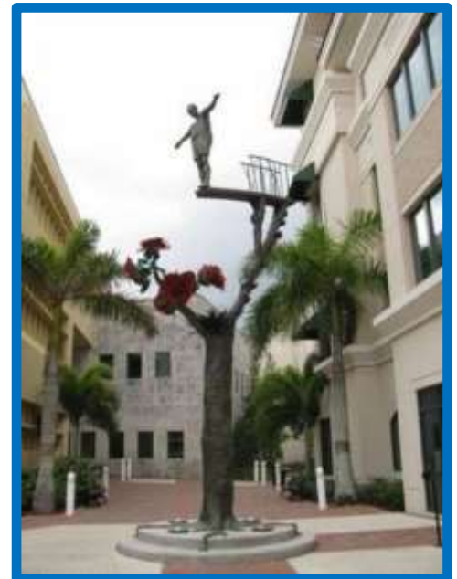
“Leap of Faith” Fort Pierce City Hall