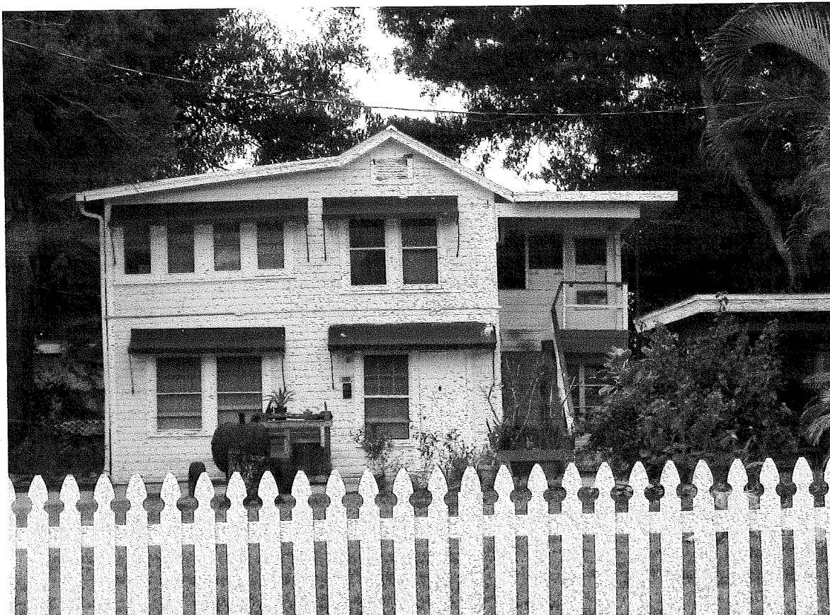
Property photographs from year 2007