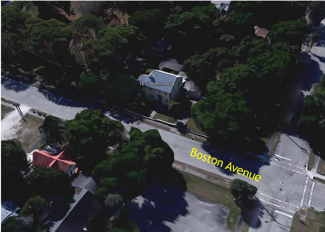
Aerial of the subject property

The applicant is requesting approval of a COA application to remove three non-functioning wood frame kitchen windows, and replace them with new CGI Estate Aluminum windows with wood grain finish.