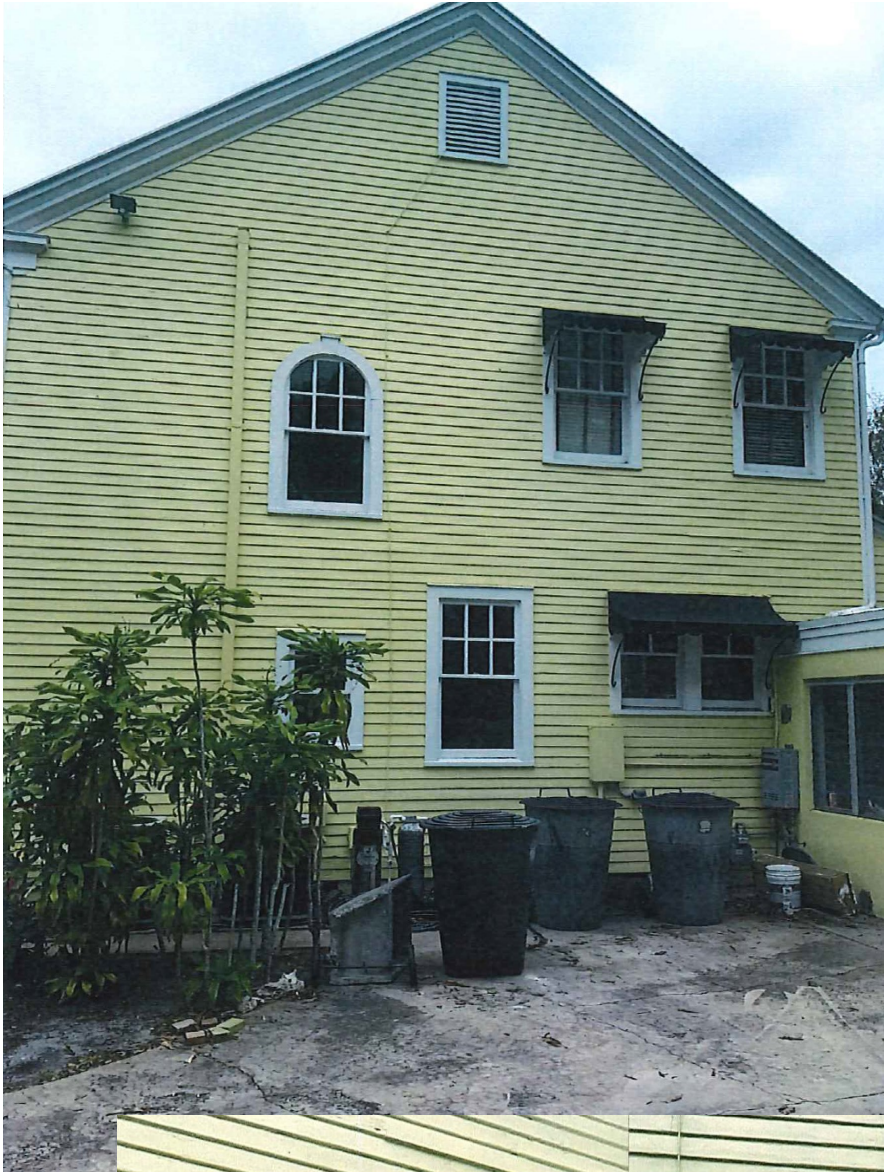
Kitchen windows to be replaced