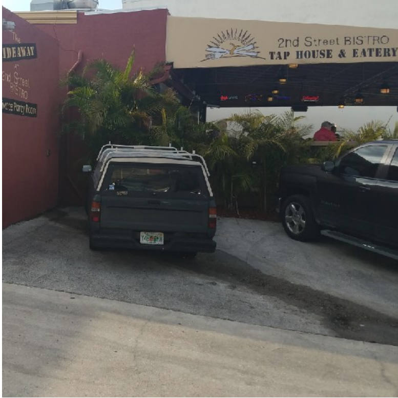
Existing site conditions

The applicant is requesting consideration of approval for installation of the exterior 16' x 14' fiberglass walk-in cooler/freezer with stucco finish painted to match existing buildings.