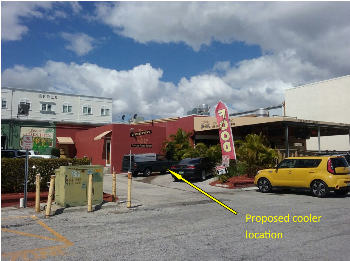
Rear View of the Site