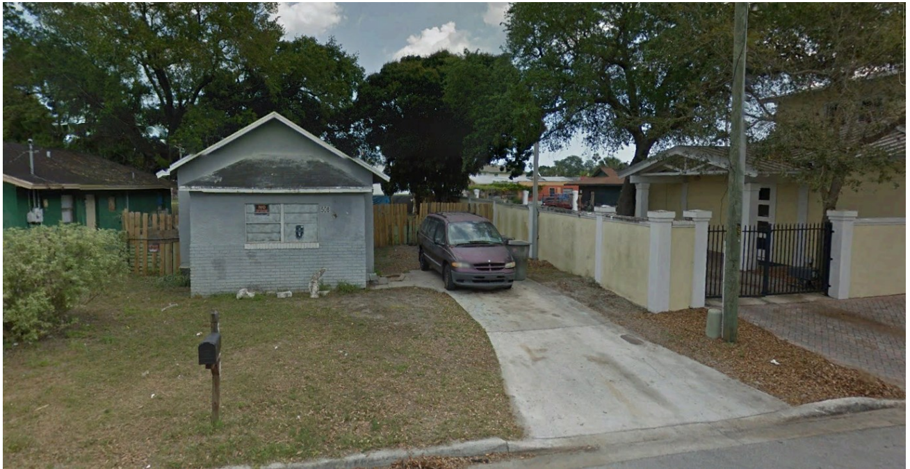
Front yard of the property