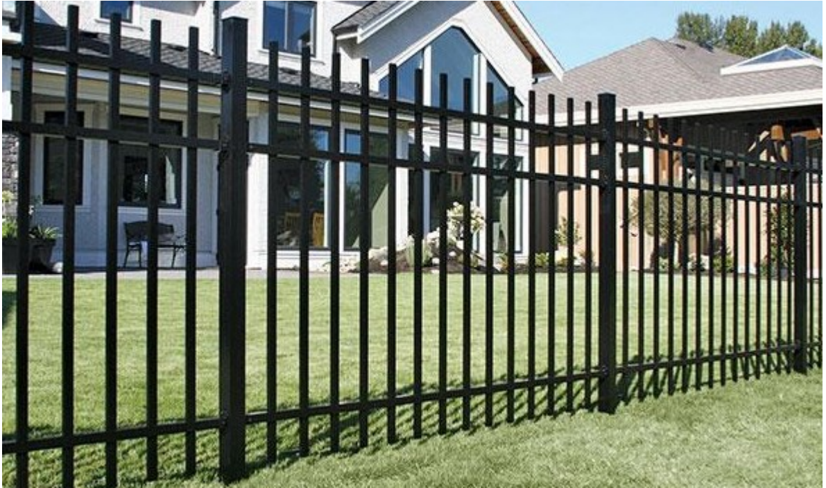
Proposed type of the fence