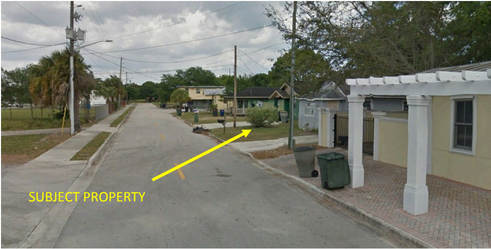
Street view looking north