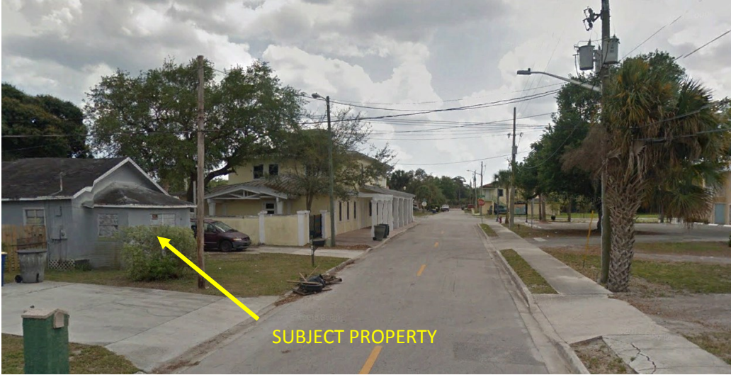
Street view looking south