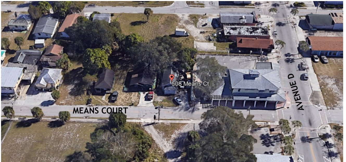
Aerial views of the subject property