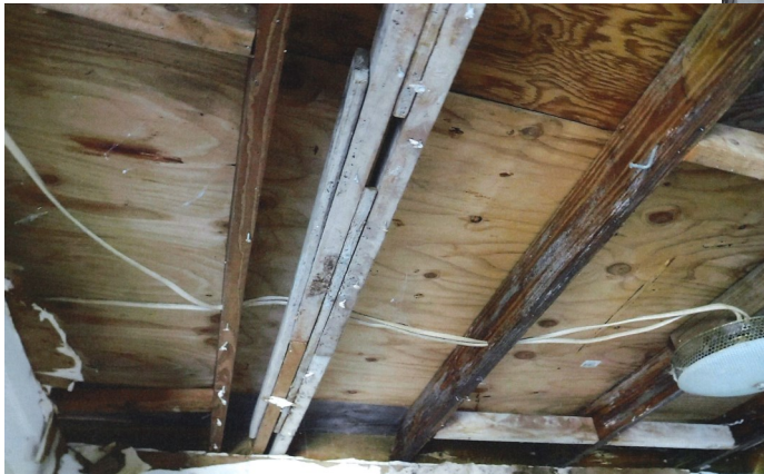
Damaged elements