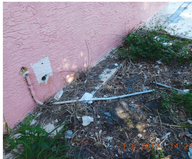
Photos of outside of the structure