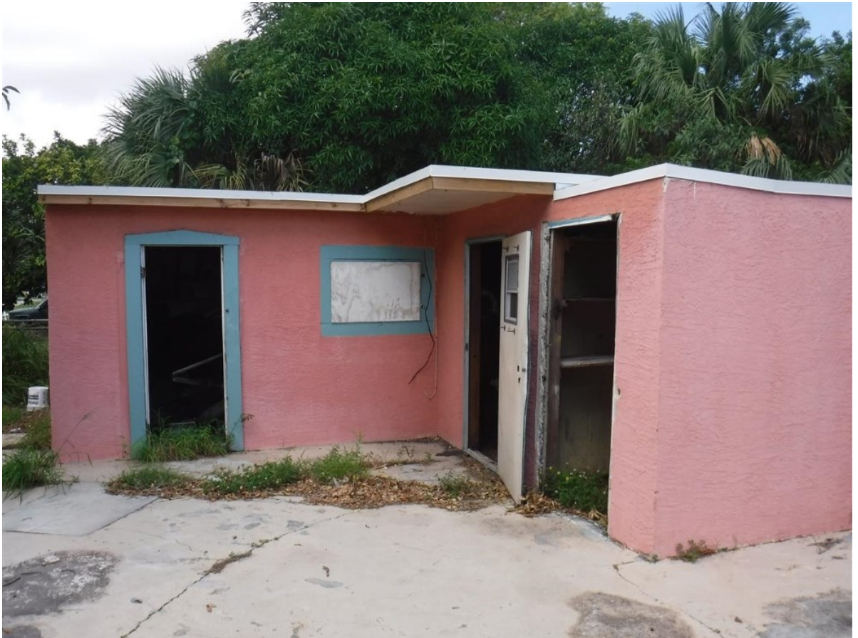
View of the subject structure

On January 6 2017, Building Department inspector completed a Property Maintenance Inspection and found that the rear structure (subject) is in major disrepair, including holes in the exterior and interior walls, missing interior walls, missing electrical, plumbing and mechanical systems, broken windows and doors.