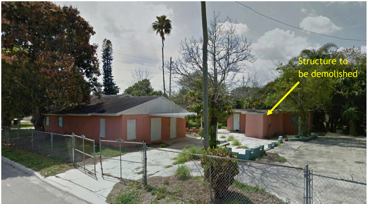
View from N 10th Street