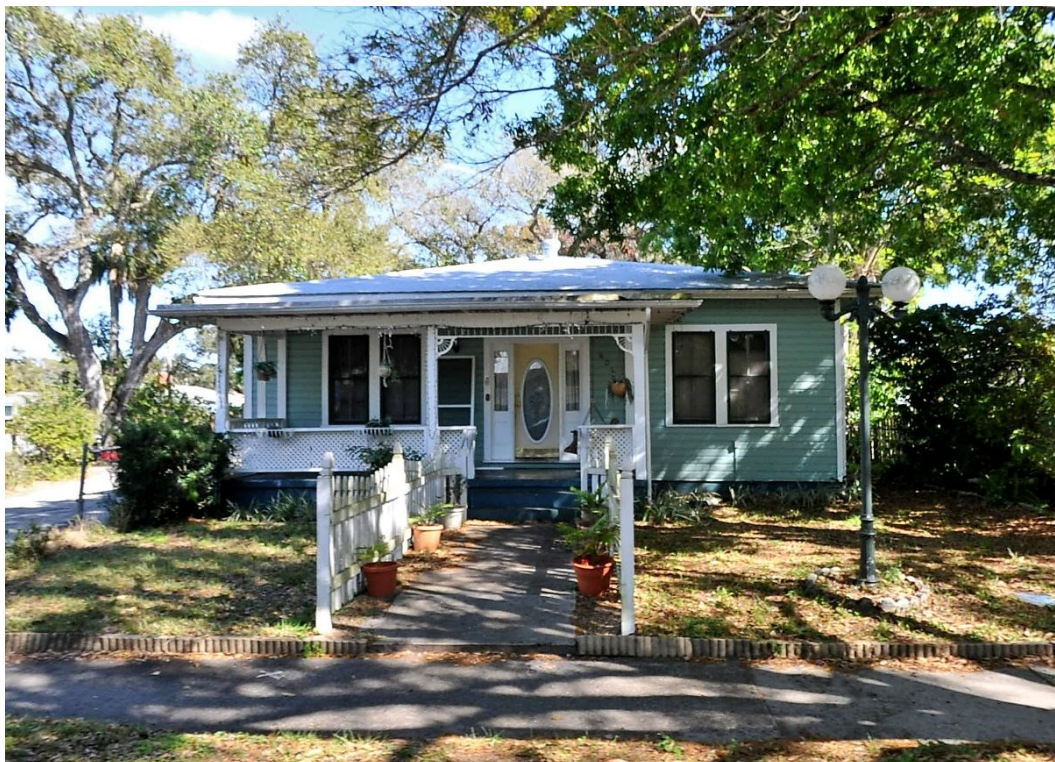
8th Street façade