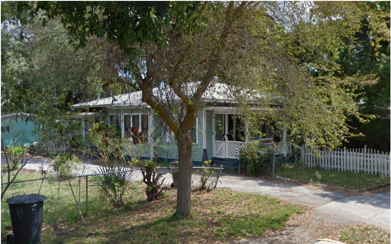
North side façade

The request to replace the existing metal shingle roof with 5V Crimp Metal Panels presents a conflict with Secretary of Interior Standards, therefore staff recommends that the Board deny the request or condition the request approval upon the utilization of metal shingles.