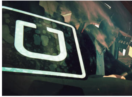
A new analysis by the Massachusetts Institute of Technology found that 74 percent of Uber and Lyft drivers earn less than the minimum wage in their state. But Uber and Lyft officials both raised questions concerning the methodology of the survey.