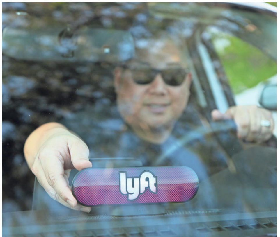
A new survey by the Massachusetts Institute of Technology shows median profit for Lyft and Uber drivers is $3.37 per hour before taxes. But both Lyft and Uber officials questioned the validity of the analysis.

Last week, Uber announced its launch of Uber Health, a desktop platform for health care providers that allows doctors to provide rides for patients who might otherwise miss their appointments because they can't get to them. Lyft has been working with health care providers for the past few years through its LyftConcierge business platform.