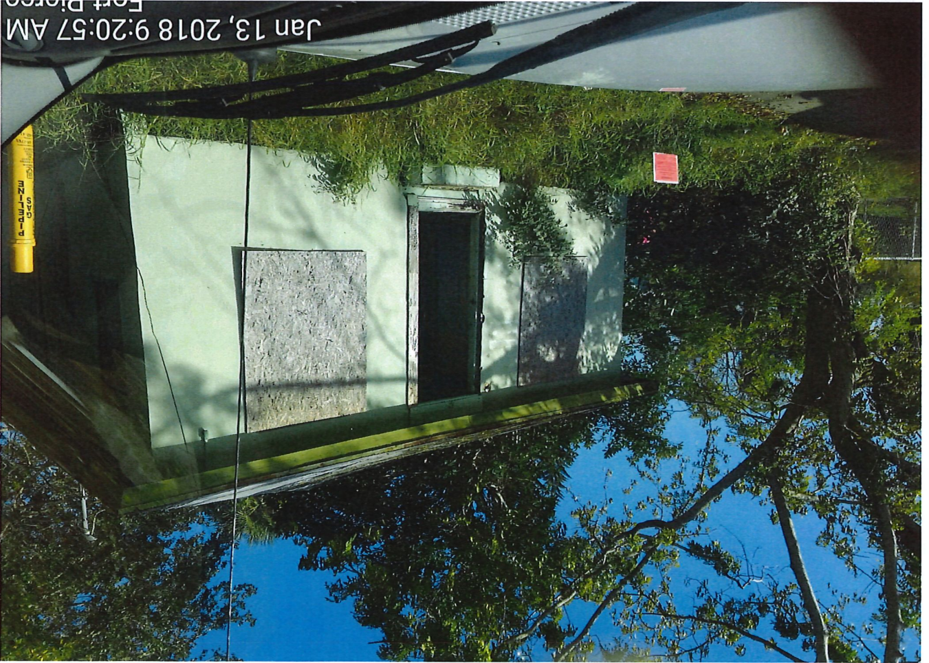
Jan 13, 2018 9:20:57 AM Fort Pierce