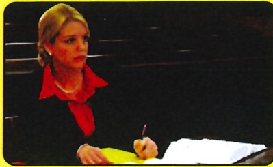
The Honorable Pam Bondi

The Honorable Pam Bondi, Florida Attorney General