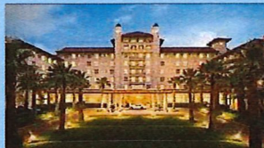
Wyndham Grand Collection