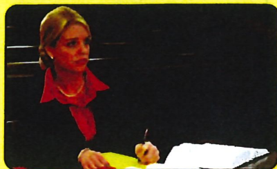
The Honorable Pam Bondi

The Honorable Pam Bondi, Florida Attorney General