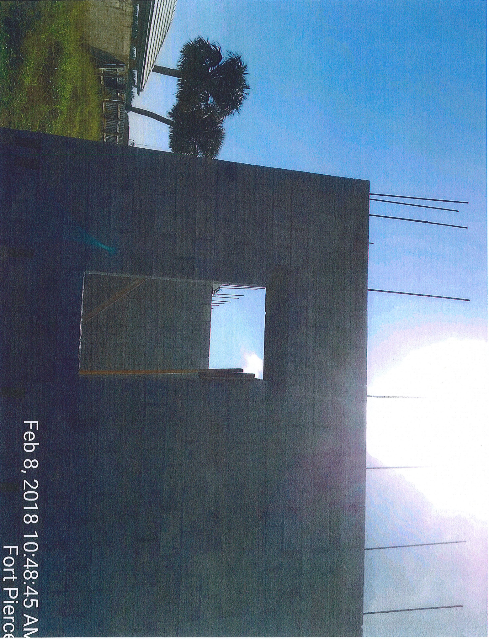
Feb 8, 2018 10:48:45 AM Fort Pierce