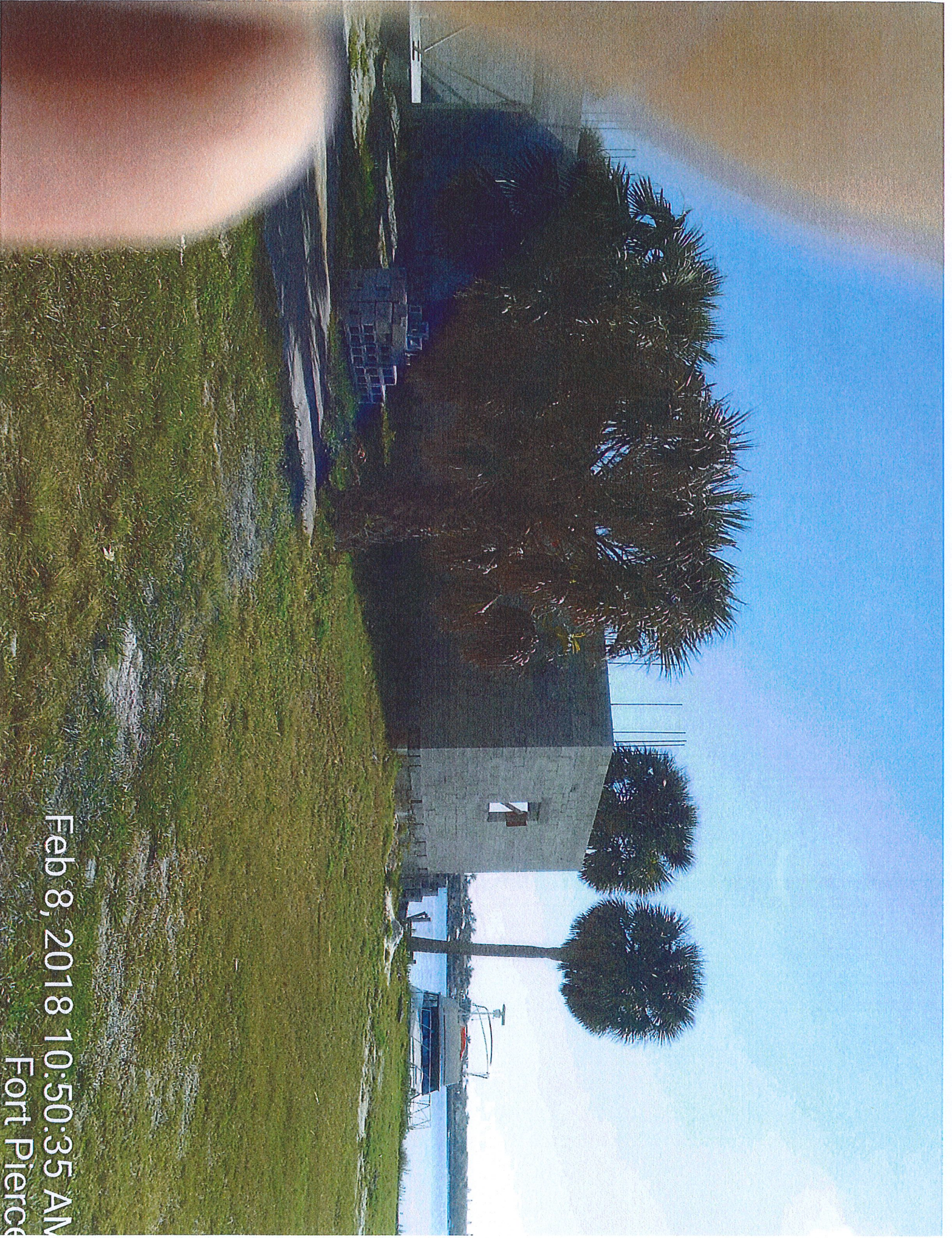
Feb 8, 2018 10:50:35 AM Fort Pierce