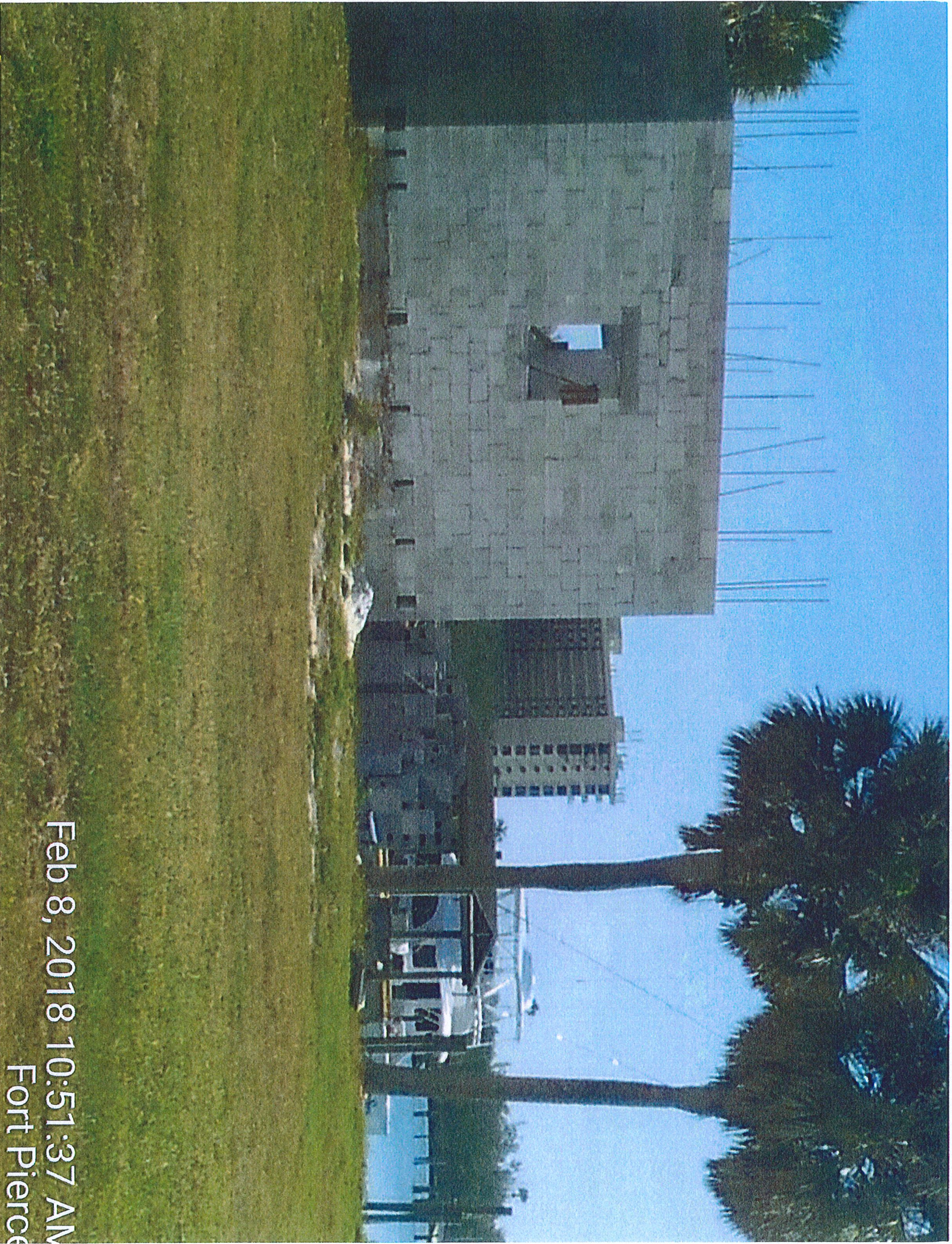
Feb 8, 2018 10:51:37 AM Fort Pierce