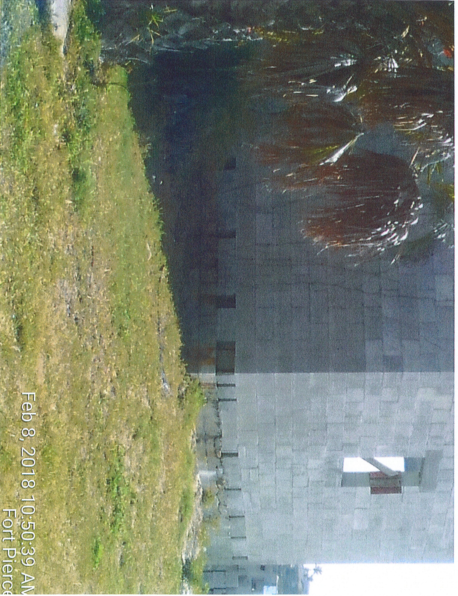
Feb 8, 2018 10:50:39 AM Fort Pierce