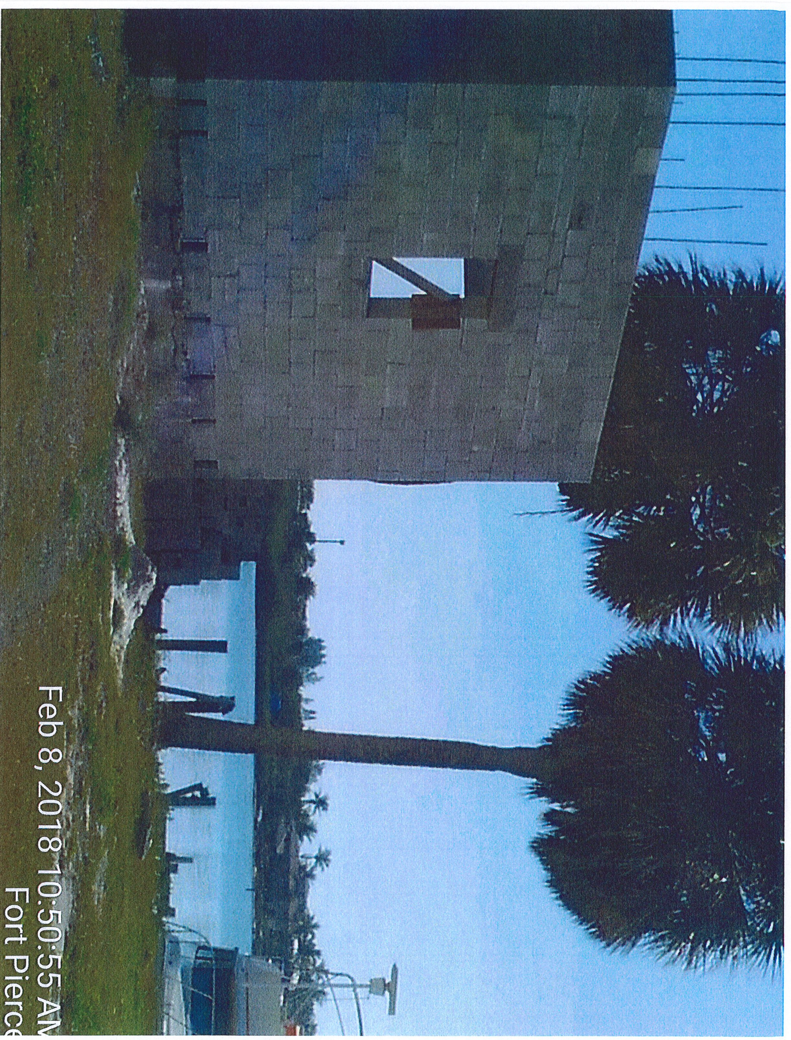
Feb 8, 2018 10:50:55 AM Fort Pierce