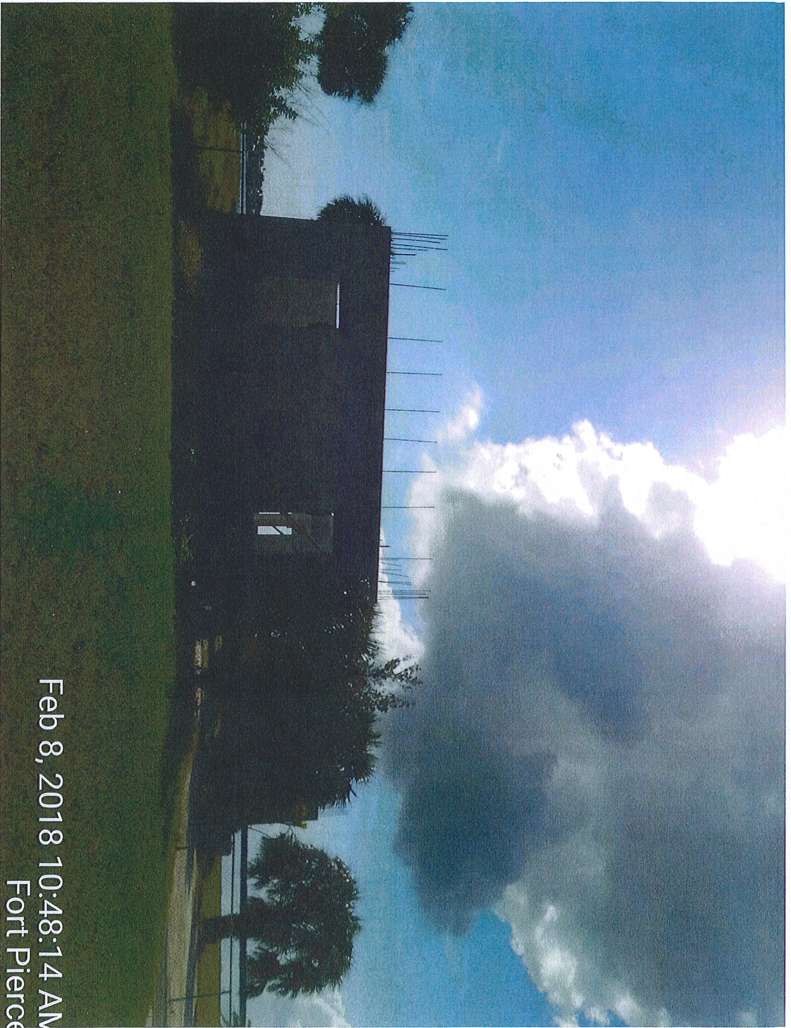
Feb 8, 2018 10:48:14 AM Fort Pierce