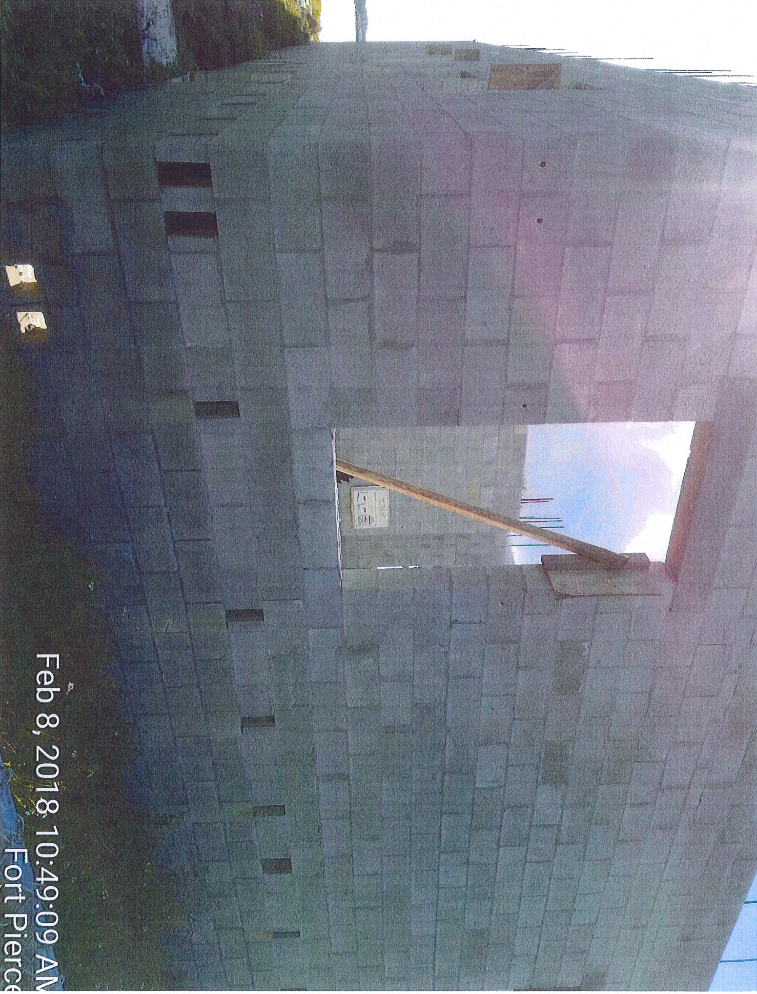
Feb 8, 2018 10:49:09 AM Fort Pierce