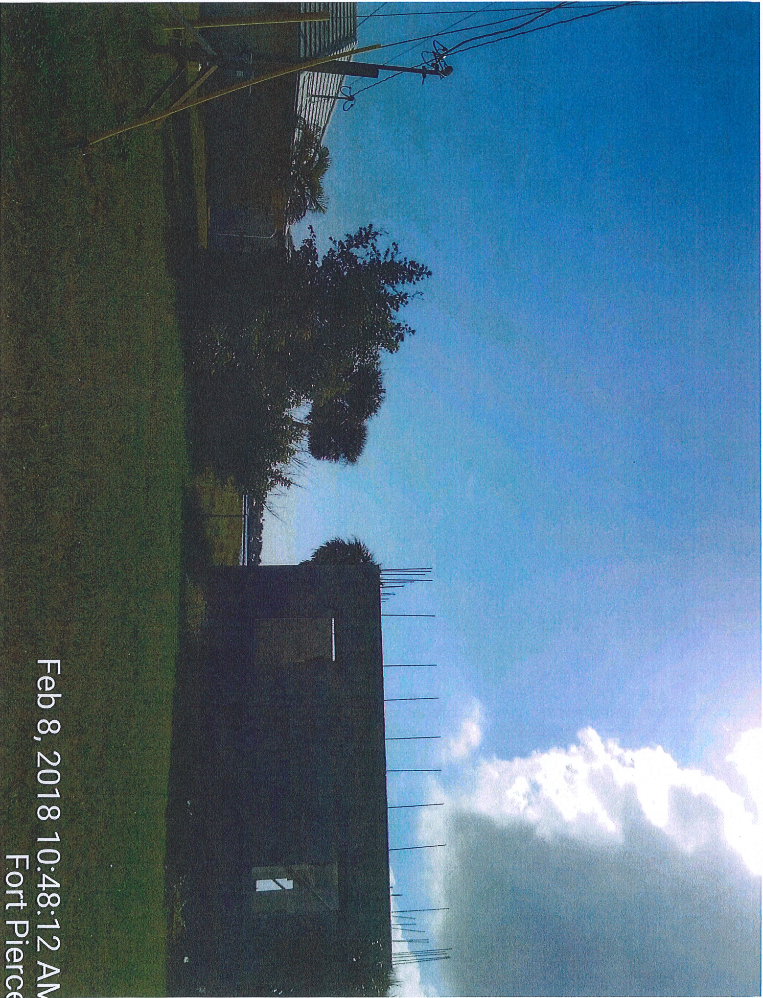
Feb 8, 2018 10:48:12 AM Fort Pierce