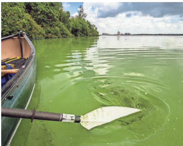
Algae swirls in the Caloosahatchee River, seen July 13 in the Fort Myers area.