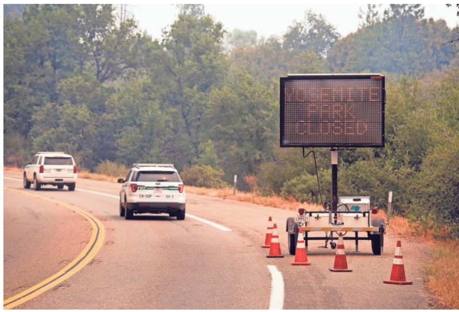
A sign on Highway 41 announces the closure of much of Yosemite National Park near Oakhurst, California. The closed areas might reopen Monday.

visitors depleted its water supply, she said.