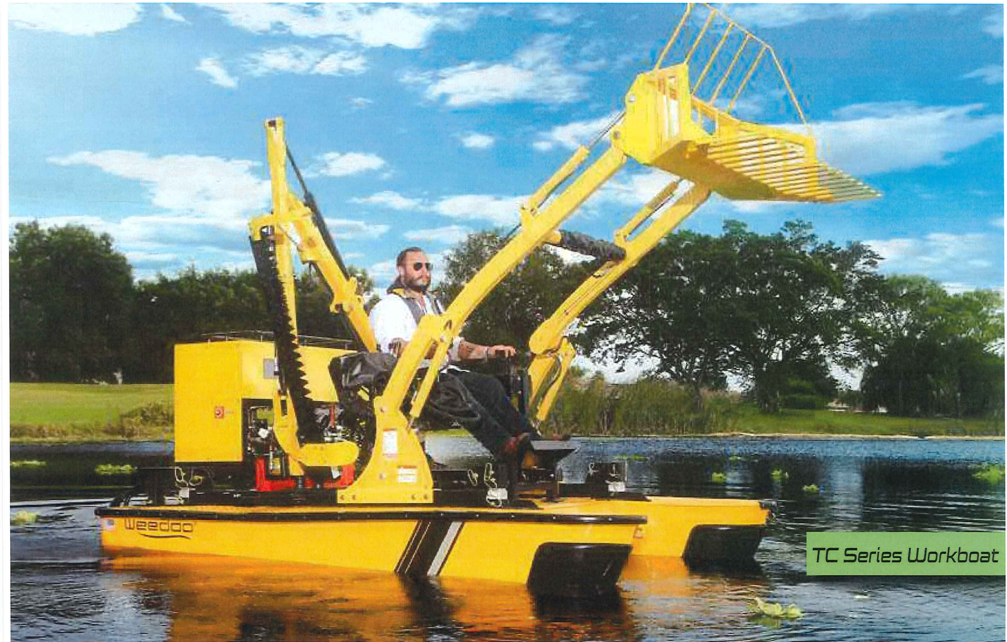
TC Series Workboat