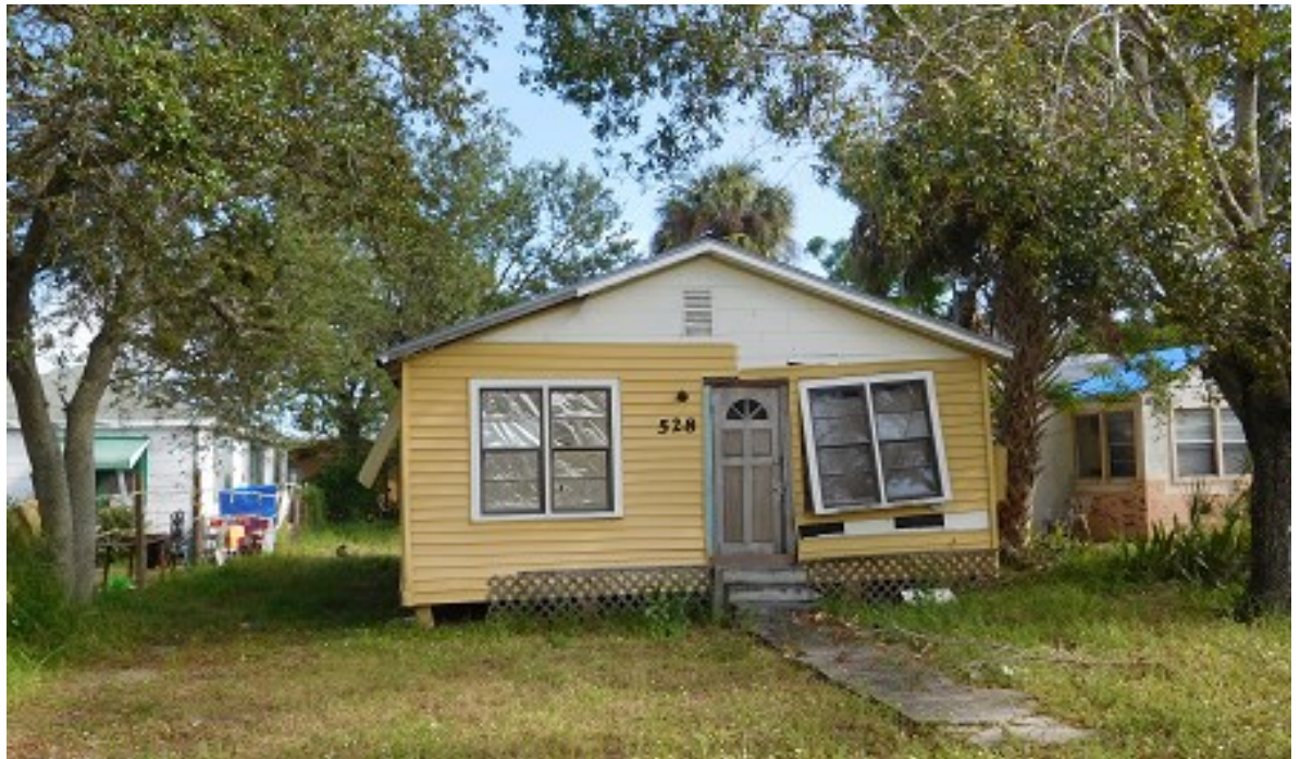
Structure to be demolished View from N 12th Street