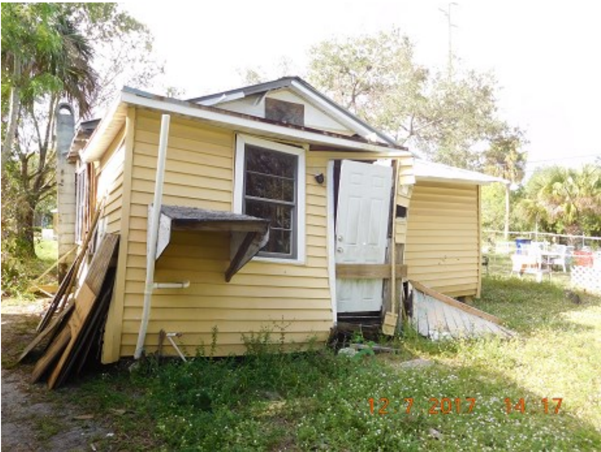
View of the subject structure

On December 7, 2017, Building Department inspector completed a Property Maintenance Inspection and found that the structure is in major disrepair, clearly unsafe and unfit for human occupancy. Portions of the structure are badly deteriorated and the whole structure is likely to partially or completely collapse. There is no safe and working electrical, plumbing, water or heating system (further details are provided in the attached Property Maintenance Inspection Report ).