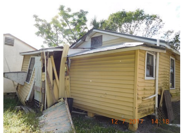
Outside of the structure