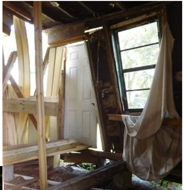
Interior damage