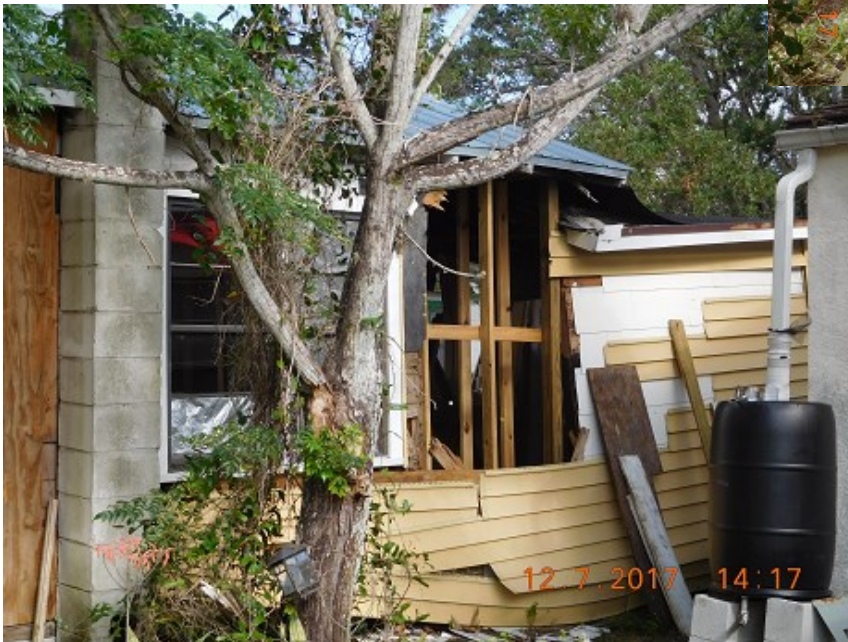
Exterior damage