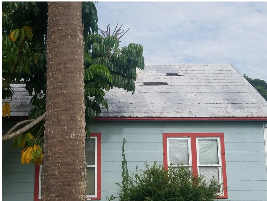
Views of the existing metal shingle roof