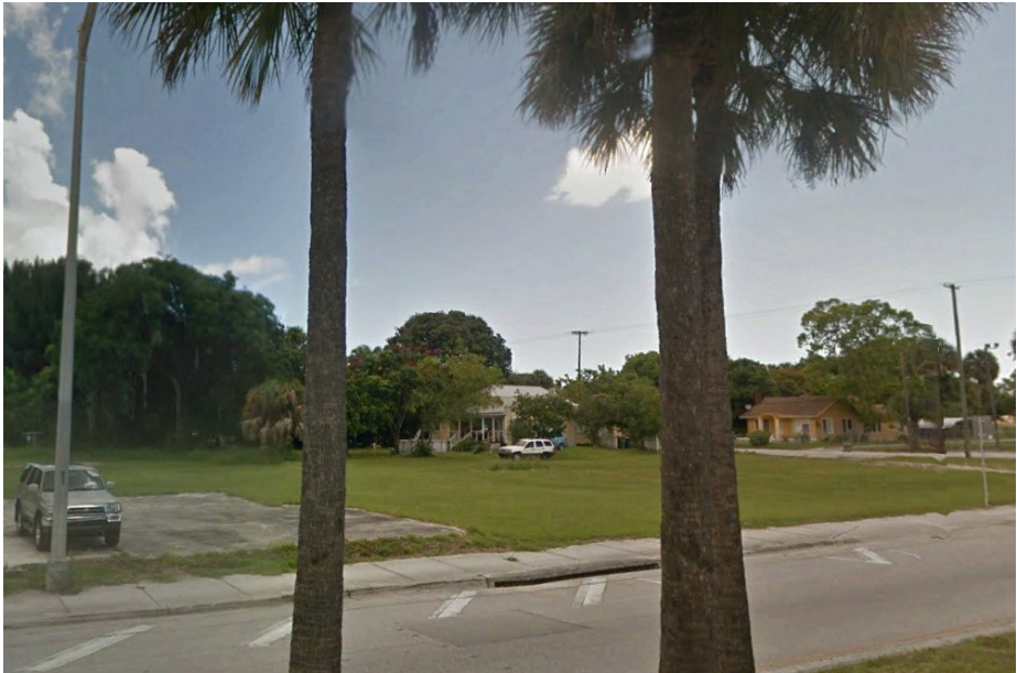
View Cross the Street