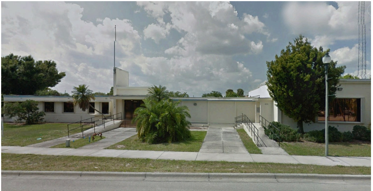
Structure to be Demolished Front Façade