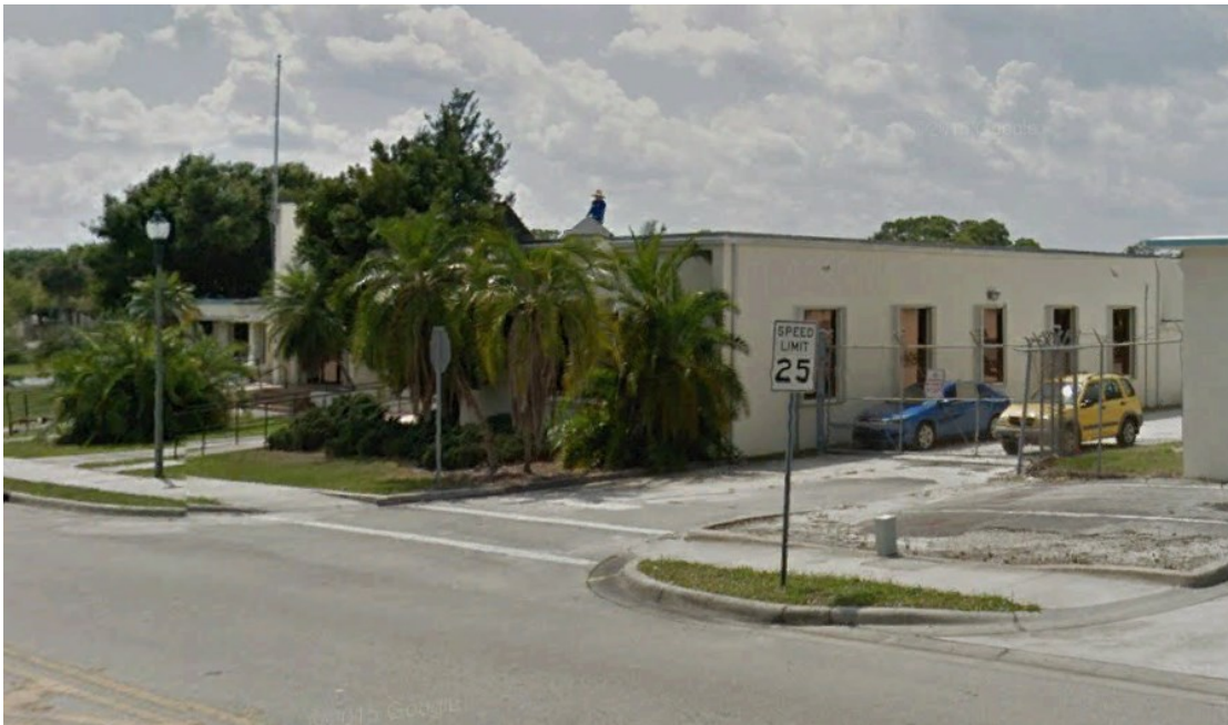
North Side Views of the Subject Structure