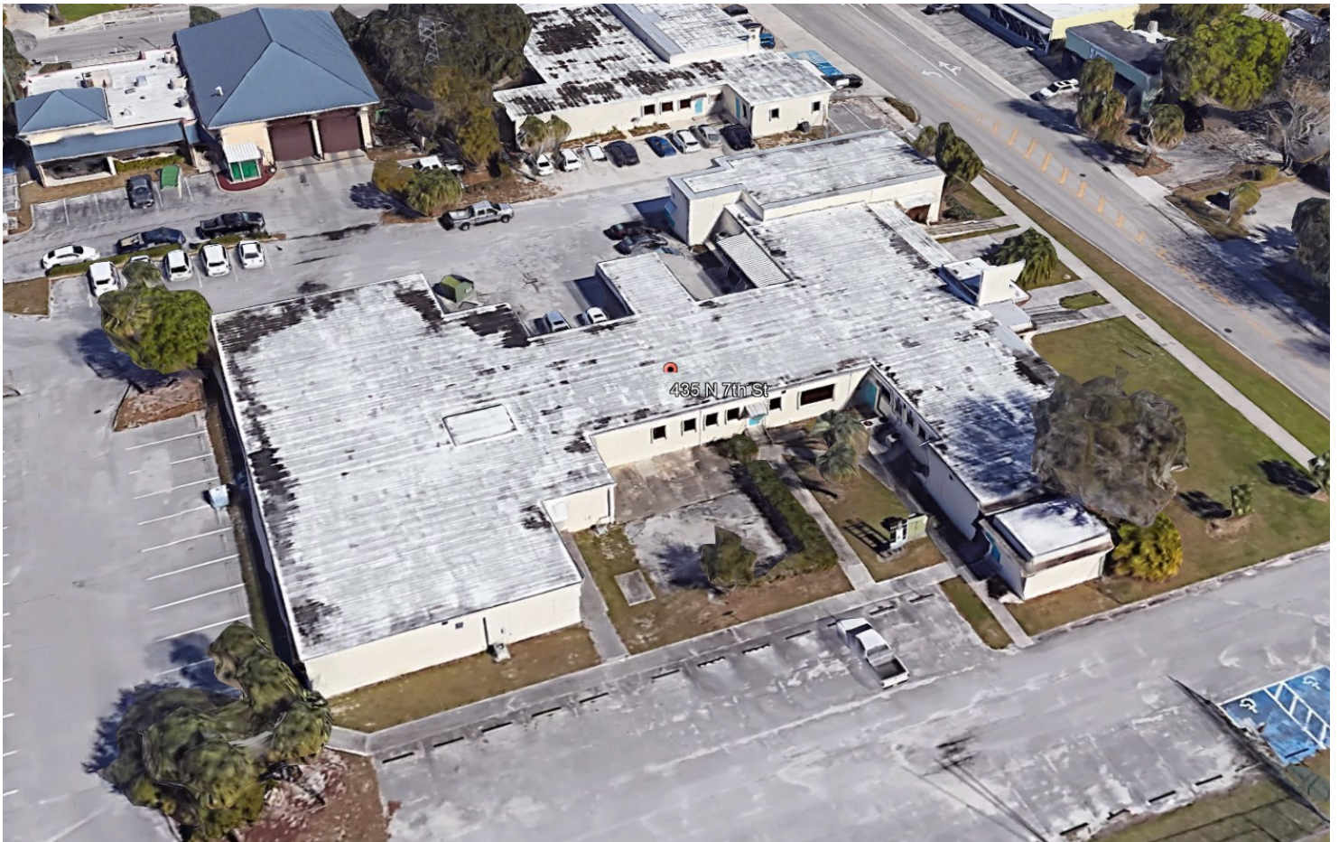
South Side Aerial View of the Subject Structure

The subject property is a governmental / public use which features 2.3 acres lot, and 20, 558 sq ft structure built in 1957. The property zoning is General Commercial (C-3).