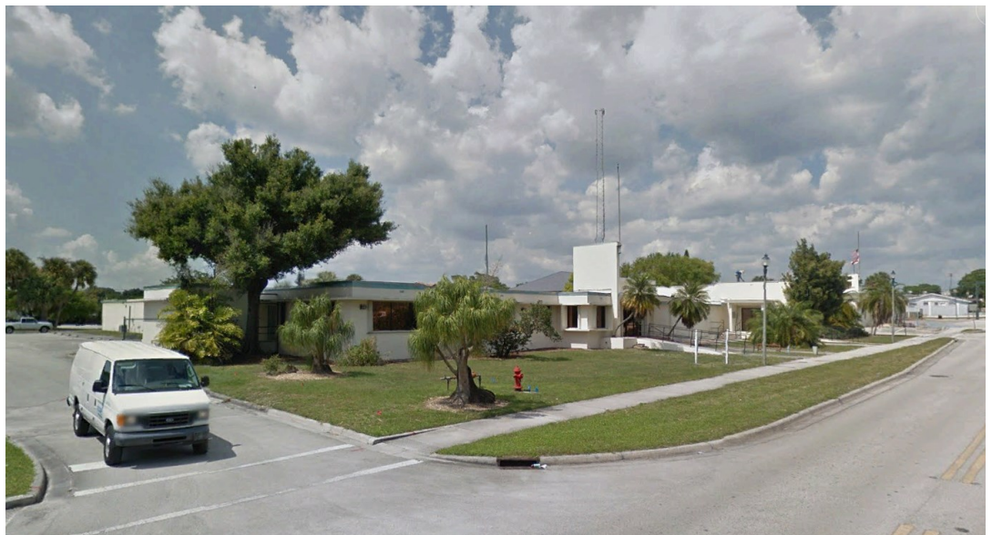
7th Avenue View