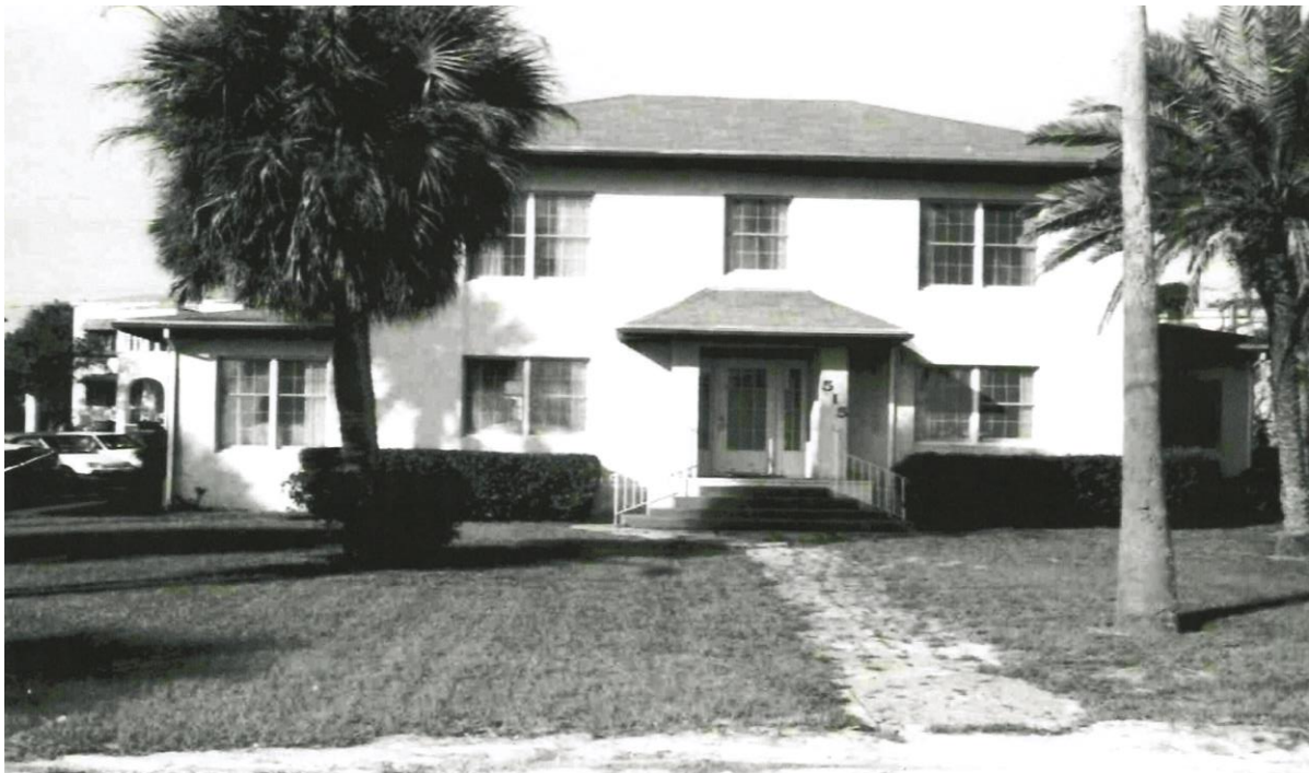
Front Façade 2002