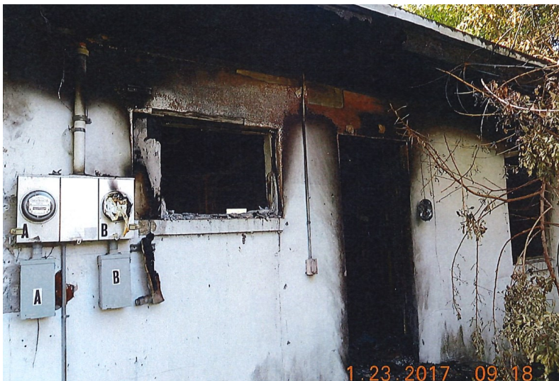
Exterior damage — pictures provided by the building inspector