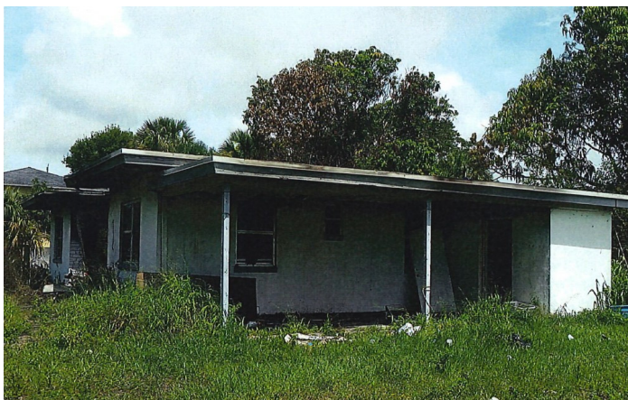
Outside of the structure