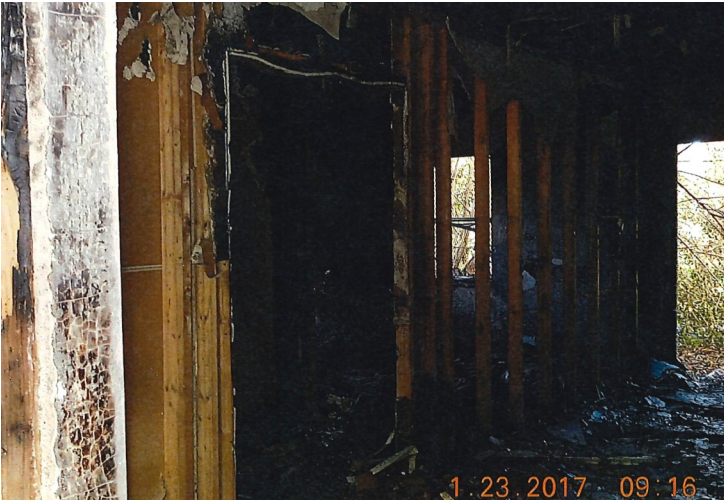
Interior damage