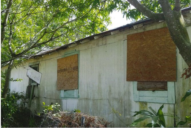
Exterior damage