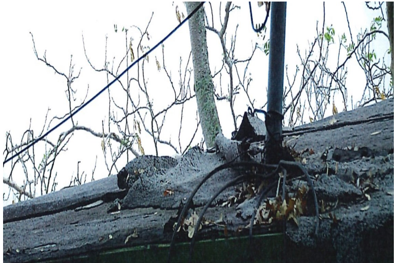
Exterior damage — pictures provided by the building inspector