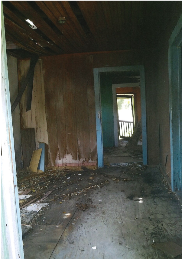
Interior damage