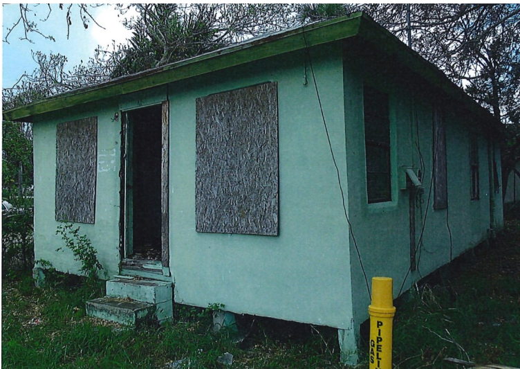
Outside of the structure