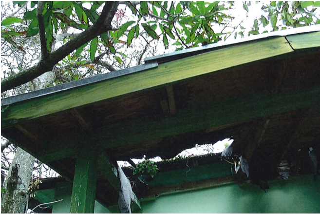
Exterior damage