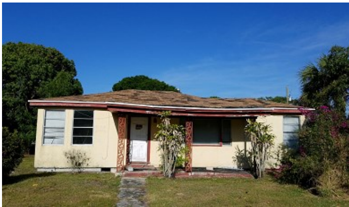
Outside of the structure