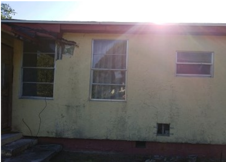
Exterior and interior damage