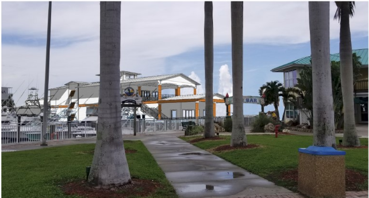
Future Street View of the Site / Crabby's Restaurant