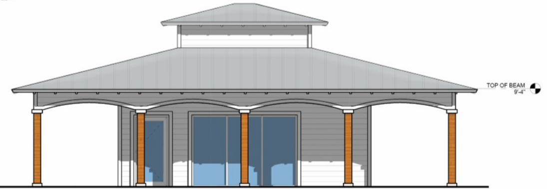
3 NORTH ELEVATION 1/4" = 1'-0"