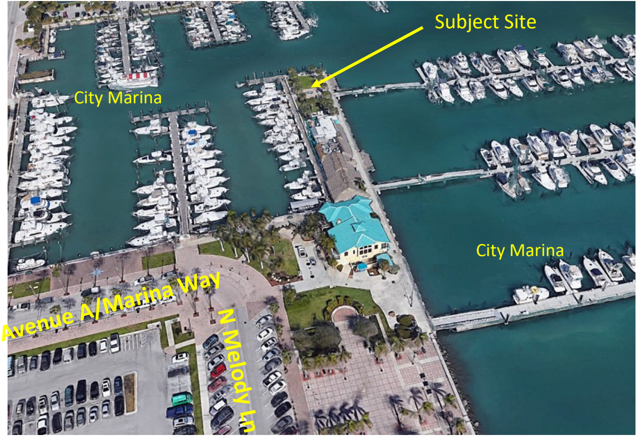
Aerial View of the Subject Site