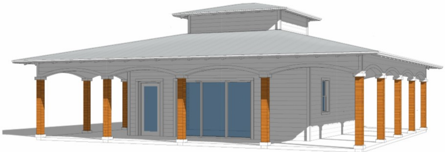
VIEW FROM NORTH EAST