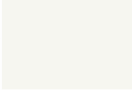
Cement Board Siding, Trim, Fascia, Soffit, Window & Door Trim Sherwin Williams - SW7757 High Reflective White