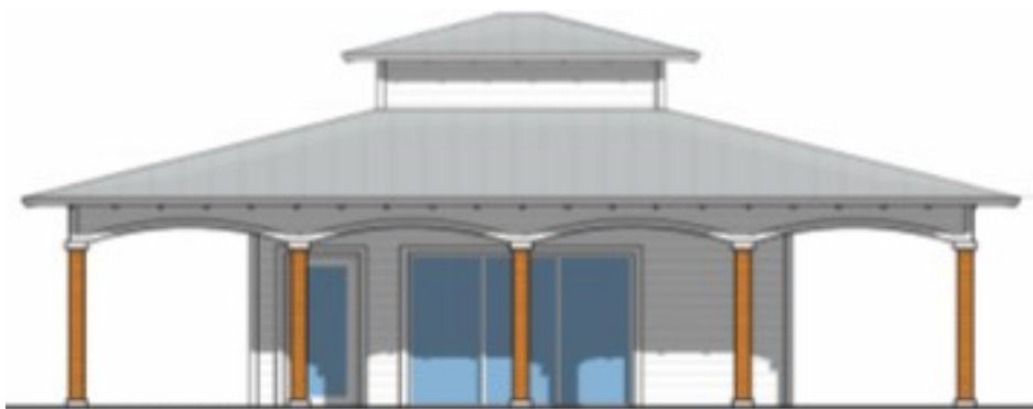
Currently proposed marina building

The overall proposal and design are consistent with the Secretary of Interior Standard 9 and 10. Staff recommends that the Historic Preservation Board approve the request as submitted.