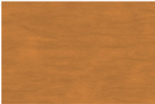
Stained Wood Accent Trim, Column Wraps, Decorative Shutters & Window Canopies Sherwin Williams - SW3513 Spice Chest