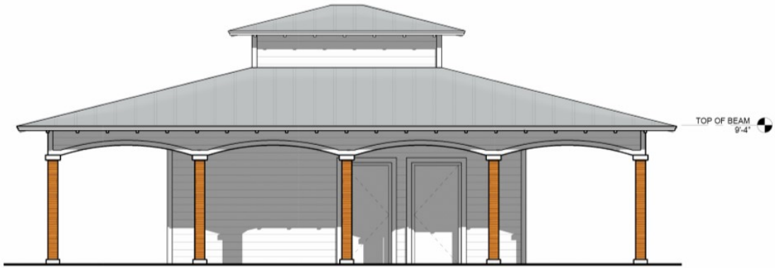
4 SOUTH ELEVATION 1/4" = 1'-0"