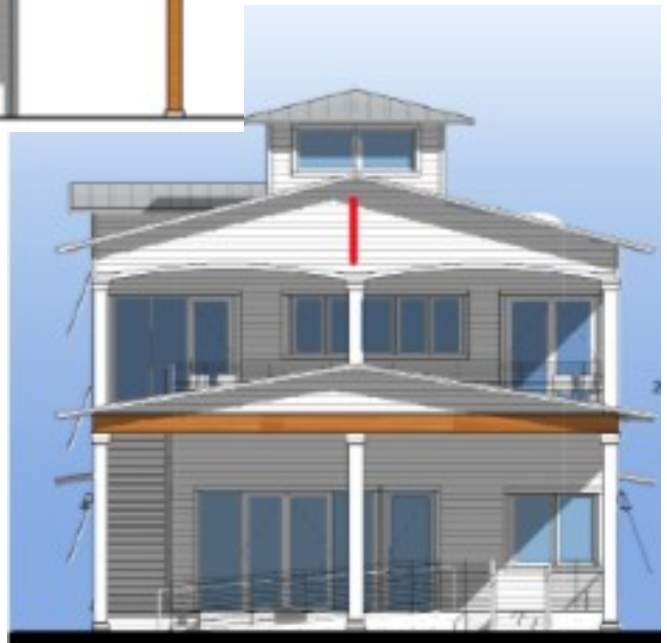
Recently approved Crabby's Restaurant