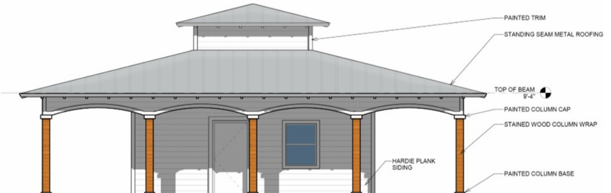
1 EAST ELEVATION 1/4" = 1'-0"