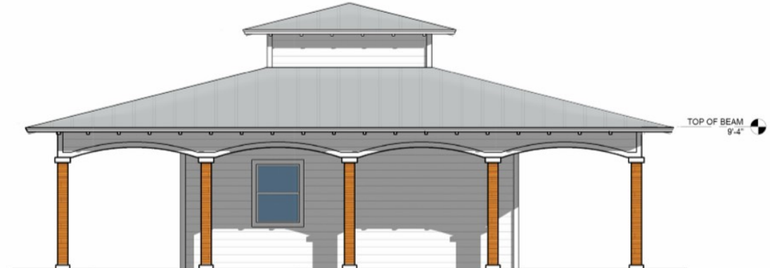
2 WEST ELEVATION 1/4" = 1'-0"