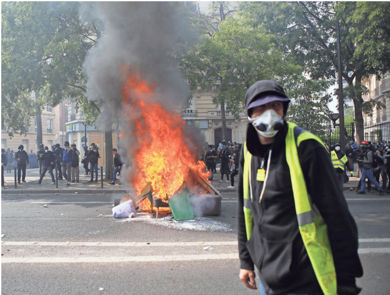
Brief scuffles between police and protesters broke out in Paris as thousands of people gathered Wednesday for May Day rallies. French authorities had warned that "radical activists" could be on hand.

Associated Press reporters saw groups of the masked and hooded pro-