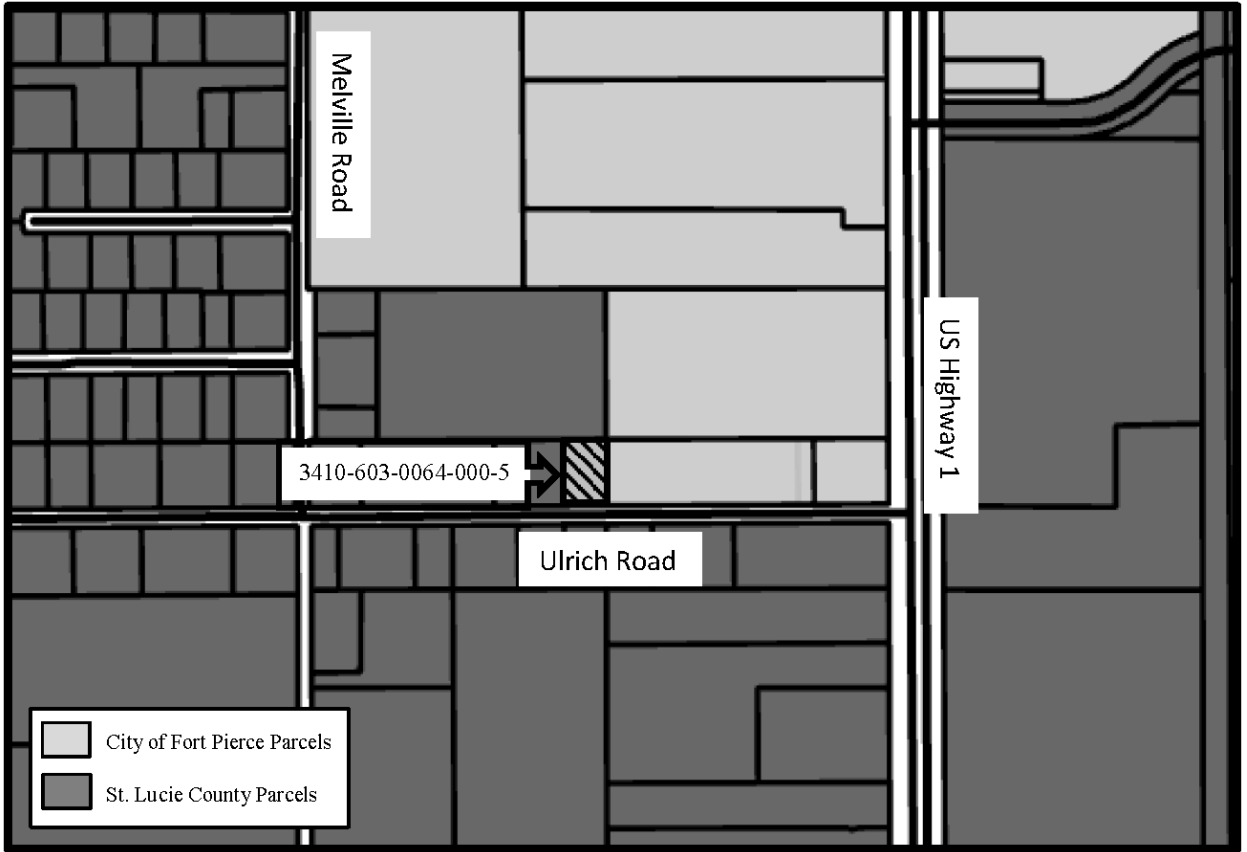
EXHIBIT A Annexed Area & Legal Description

LOTS 49 AND 50 BLOCK B, ULRICH'S SUBDIVISION, ACCORDING TO THE MAP OR PLAT THREOF AS RECORDED IN PLAT BOOK 5, PUBLIC RECORDS OF ST. LUCIE COUNTY, FLORIDA