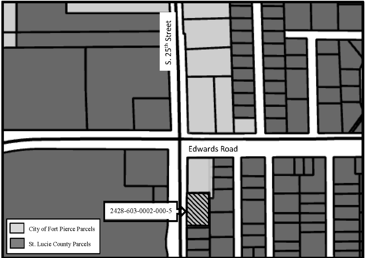
EXHIBIT A Annexed Area & Legal Description

LOTS 2, 3 & 4, LESS THE WEST 15 FEET, BLOCK 1, EDGEWOOD ACRES SUBDIVISION, ACCORDING TO THE PLAT THEREOF, RECORDED IN LAT BOOK 10, PAGE 3, OF THE PUBLIC RECORDS OF ST. LUCIE COUNTY, FLORIDA