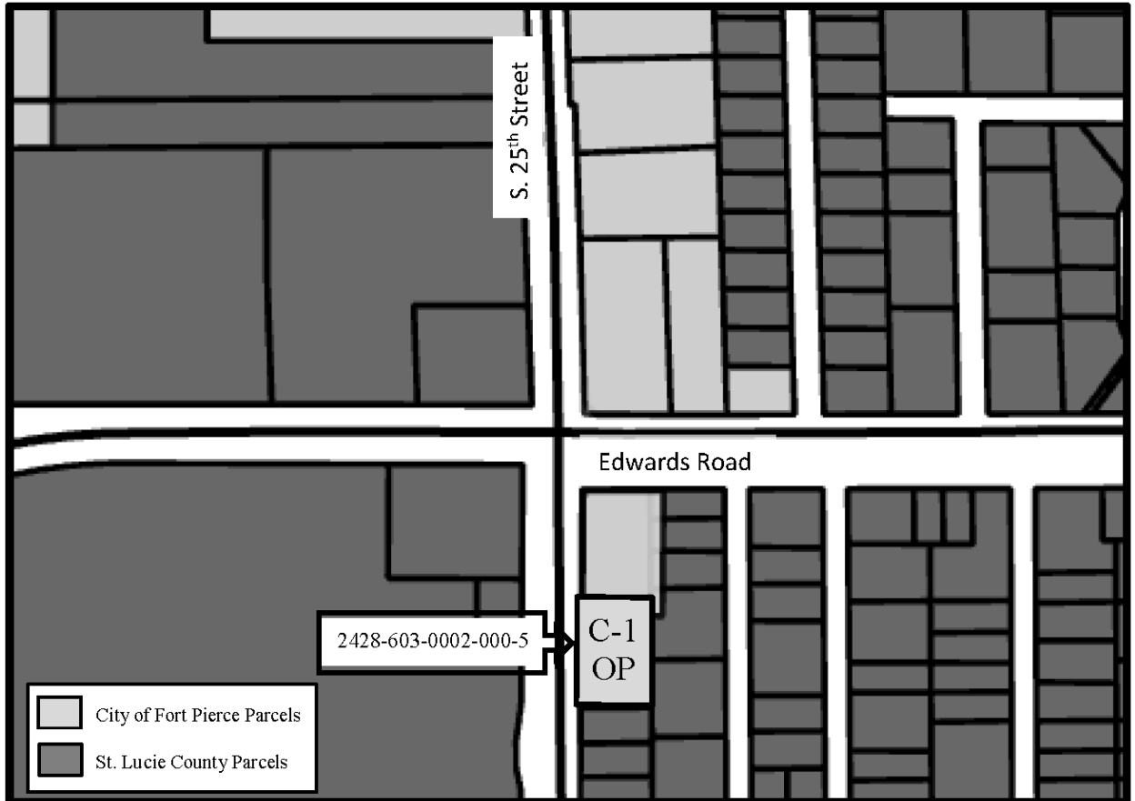
EXHIBIT B Zoning & Future Land Use Designation Assignment

The property to be annexed is currently zoned CO, Commercial Office, with a Future Land Use of RU, Residential Urban. Once annexed, this parcel will have a City of Fort Pierce Zoning Designation of C-1, Office Commercial, and have a Future Land Use Designation of OP, Office Professional.