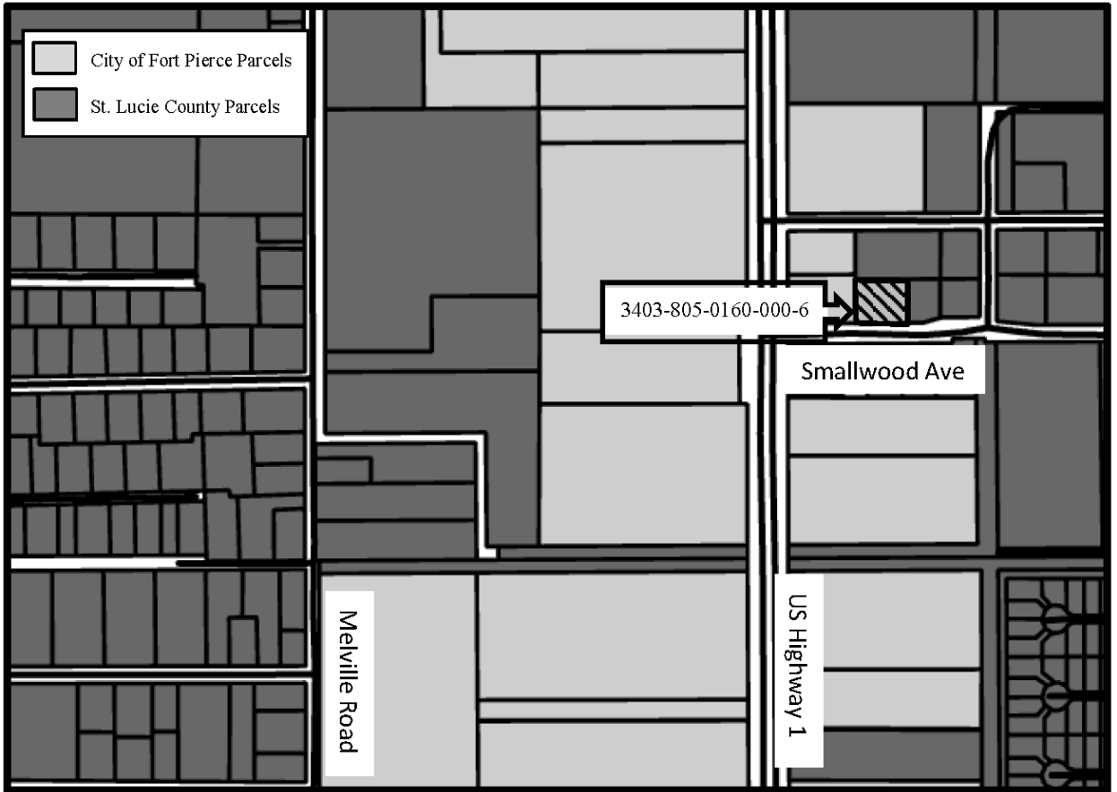
EXHIBIT A Annexed Area & Legal Description

LOTS 16, 17 & 18, BLOCK 8, RUHLMAN SUBDIVISION, ACCORDING TO THE PLAT THEREOF RECORDED IN PLAT BOOK 9, PAGE 55, ST. LUCIE COUNTY, FLORIDA