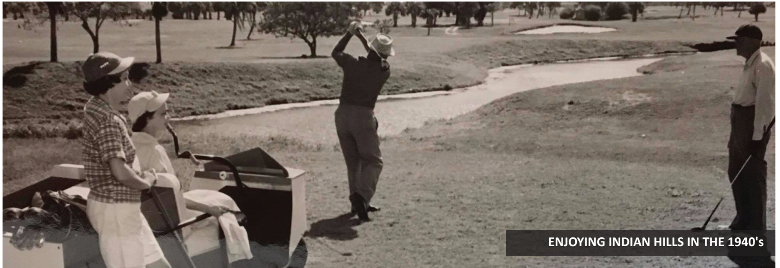
ENJOYING INDIAN HILLS IN THE 1940's