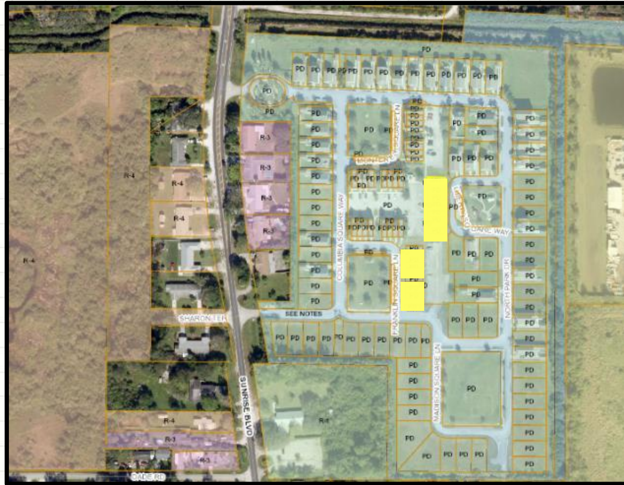
Zoning: Planned Development (PD)