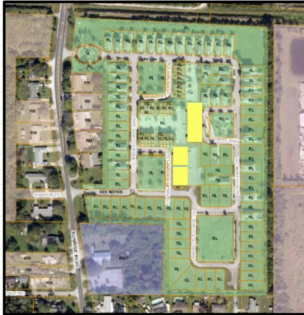
Residential Low (RL)