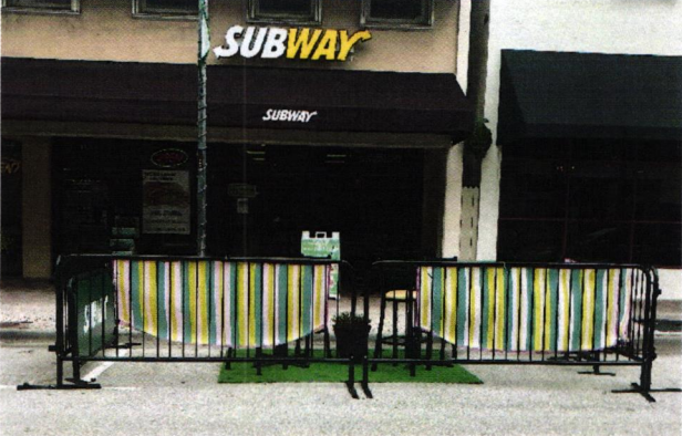
Notions & Potions- 116 N. 2 nd Street, suite 103