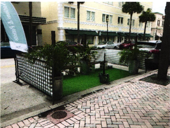
Rooster in the Garden- 100 S. 2 nd Street