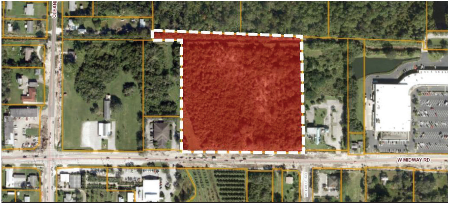
APPLICATION FOR ANNEXATION | 706 MIDWAY ROAD | AERIAL MAP

Conditional Use and Site Plan Approval | Savannah Ridge located at 3030 South US Highway