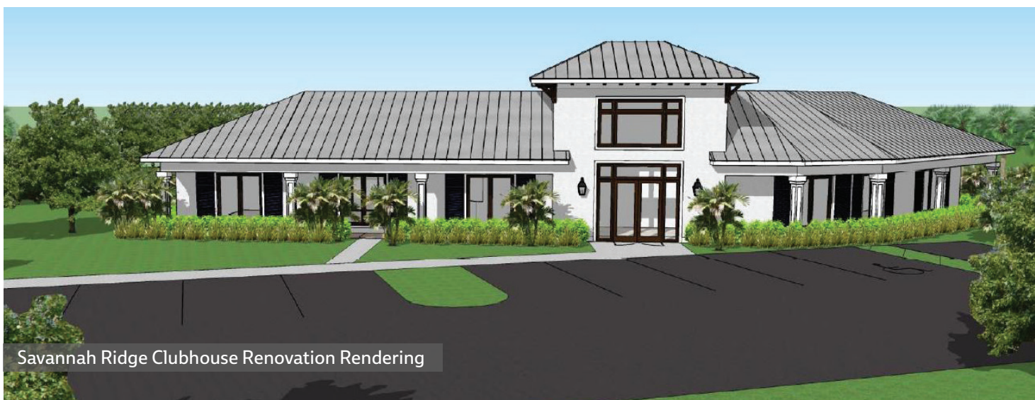
Savannah Ridge Clubhouse Renovation Rendering

home sites consisting of a mix of rental and owner-occupied units. The residents will have the option of locating their own home within the community or renting a home provided by the applicant, Yes Communities. The applicant will also be providing lease to own options for residents who are not ready to own. The existing clubhouse will undergo an extensive renovation, which will bring a pool, patio, outdoor kitchen, active play area, and a half-court basketball court as onsite amenities for the residences. Additionally, coordination between St. Lucie County and the applicant has been initiated to provide residents with direct pedestrian access to the nature trails within the Savannah Preserve. As such, an access easement has been provided on the site plan on the eastern side of the property. Also proposed is a continuous four (4)-foot sidewalk and a pond with a deck central to the community surrounded by a walking trail with a potential for a kayak launch.