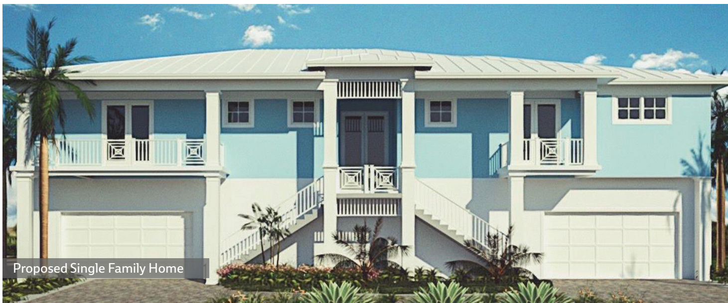
Proposed Single Family Home

The architectural style of the home reflects an island design that blends with and complements the surrounding scenery. The proposed height of the structure will be under 35 feet to comply with City Code section 125-157 (1)(c)(2) that regulates height for single family homes zoned R-1 within the South Beach Overlay District. There are no architectural embellishments that project beyond the maximum allowable height of 35 feet. Lastly, the Planning Board recommended approval for a Conditional Use and Site Plan Approval for Savannah Ridge, a manufactured home park with 202 home sites designed by Brian Nolan, AICP, ASLA, of Lucido & Associates. The subject site was previously a manufactured/mobile home community known as Pleasure Cove and due to severe hurricane damage in the mid-2000's the site closed. The owners at that time chose not to rebuild. The Pleasure Cove development supported 209 home sites. The current request is a reduction of seven (7) home sites. The proposed project will consist of 202