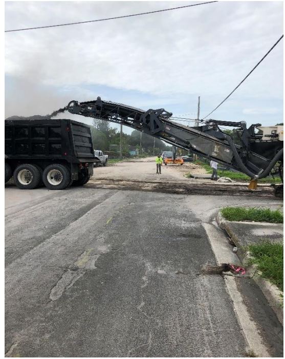
Asphalt milling 17 th St. south of Avenue D