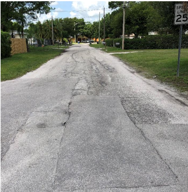
Fulton Drive Looking West from Pierce Street