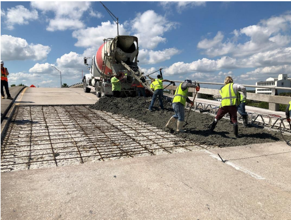
First concrete pour – west-bound lane