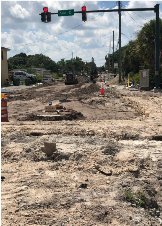
Intersection of 17 th St. & Ave. D facing south