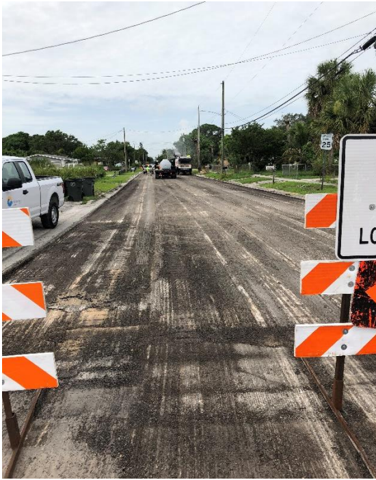
Asphalt milling 17 th St. south of Avenue D