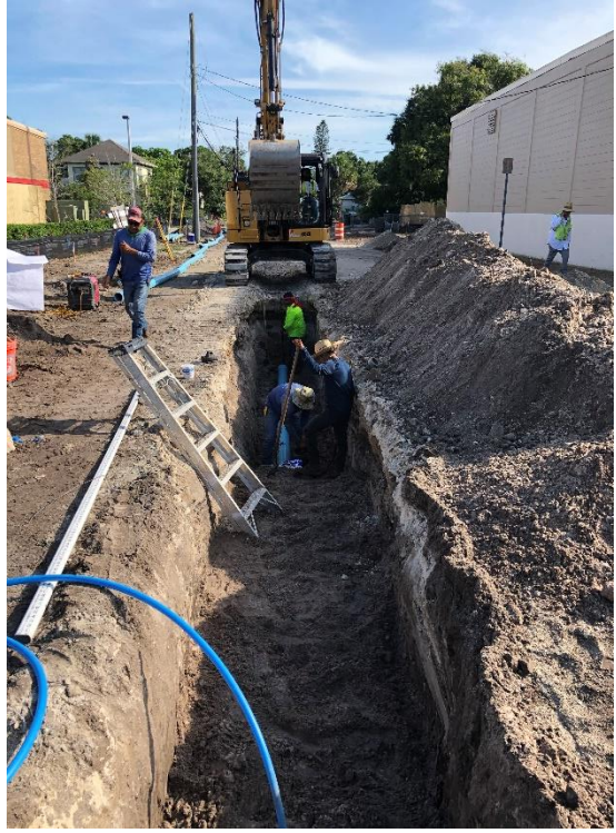
Water main installation 17 th St. near Orange Avenue