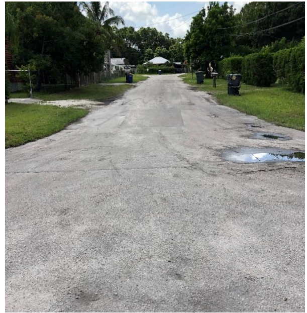
Pierce Street Looking South