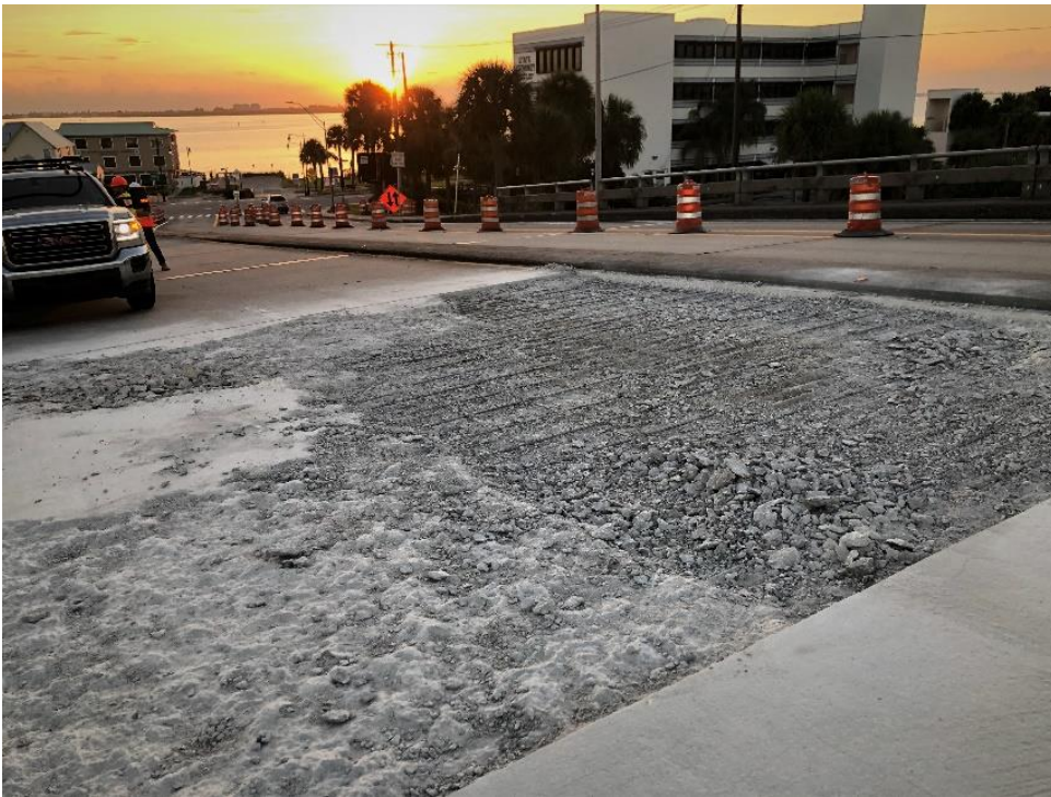
Demolition of west-bound bridge deck underway.