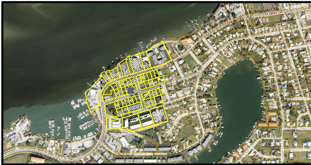
500-foot Radius Map Conditional Use with No New Construction 1182 Binney Drive

If you have any questions, please contact the City Planning Department at 772-467-3737.