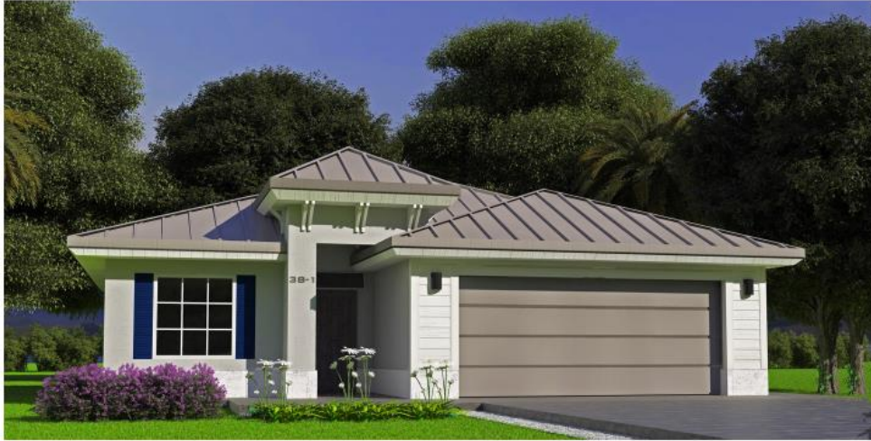
ELEVATION A - 3 BEDROOM | 2 BATH