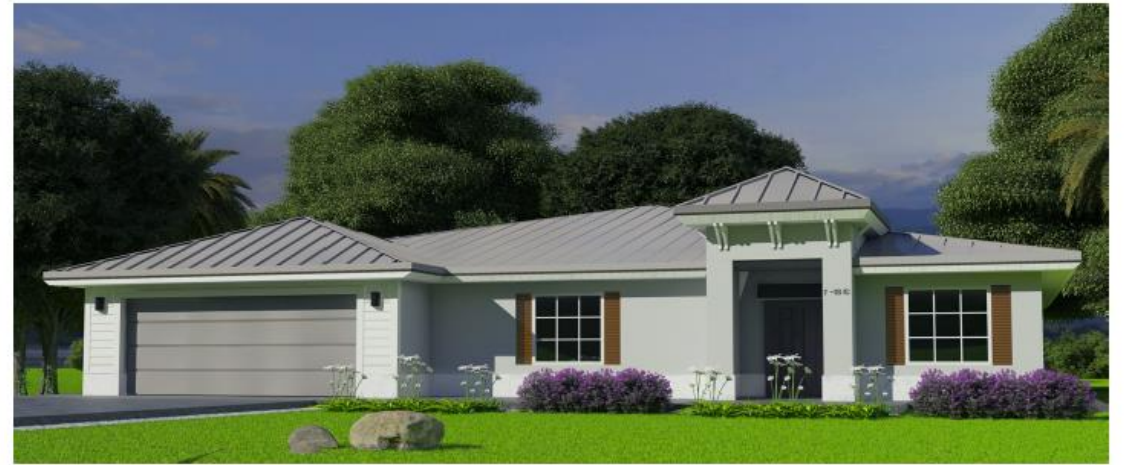
ELEVATION C - 3 BEDROOM | 2 BATH