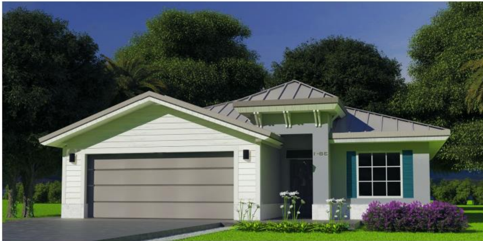
ELEVATION B - 3 BEDROOM | 2 BATH