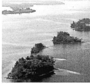
A stretch of the spoil islands in the Indian River Lagoon.