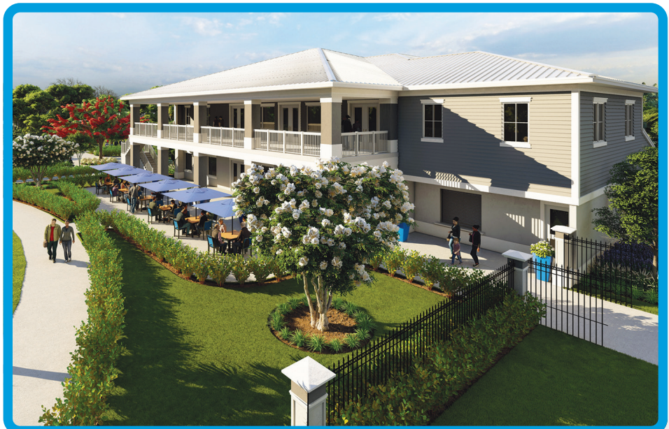
Rear of the Lighthouse Teen Development Center.