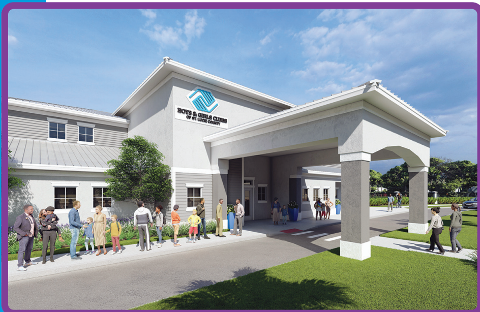
Lighthouse Teen Development Center front entrance facing Dr. Martin Luther King, Jr. Blvd.