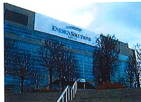
The same arena was renamed EnergySolutions Arena (now Vivint Arena ) in late 2006. Temporary signage covered up the previous Delta Center logo after the new naming rights sponsor was announced.