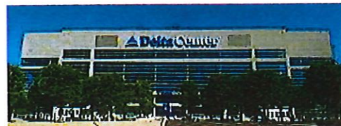
Delta Air Lines held the naming rights to the main indoor arena in Salt Lake City from 1991 to 2006.