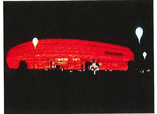
Allianz Arena , Munich , Germany , whose naming rights were purchased by the financial services company Allianz SE

Sports stadiums with naming rights deals are not limited to the United States. "Named" stadiums can be found in countries including Australia, Japan, China, Finland, Canada, Israel and Germany, where 8 of the 10 largest football stadiums have their naming rights sold to corporate sponsors. The practice is widening in the United Kingdom; for instance the current stadium of Bolton Wanderers is the University of Bolton Stadium (after 17 years as Reebok Stadium and 4 as Macron Stadium ) and Arsenal Football Club's stadium (opened for the 2006/2007 season) is the Emirates Stadium , their previous ground being Arsenal Stadium . In cricket, the most famous example is The Oval , home of Surrey County Cricket Club . It has had several sponsors over the years, and is currently known as " The Kia Oval ", having originally been known as the " Kennington Oval ", after the district of London in which it is located.