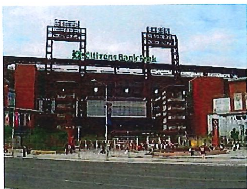
Citizens Bank Park baseball stadium in Philadelphia ; naming rights were purchased by Citizens Financial Group in 2003 for twenty years at $95 million.

Naming rights in United States may have been traced back to 1912 with the opening of Fenway Park in Boston . The stadium's owner had owned a realty company called " Fenway Realty " (itself named for a nearby parkland), so the promotional value of the naming has been considered. [8] Despite this, it is more widely believed to have begun in 1926 when William Wrigley , the chewing gum magnate and owner of the Chicago Cubs , named his team's stadium " Wrigley Field ". In 1953, Anheuser-Busch head and St. Louis Cardinals owner August Busch, Jr. proposed renaming Sportsman's Park , occupied by the Cardinals, " Budweiser Stadium ". [9] When this idea was rejected by Ford Frick , the Commissioner of Baseball at that time, Anheuser-Busch then proposed the title " Busch Stadium " after one of the company's founders. The name was readily approved, and Anheuser-Busch subsequently released a new product called " Busch Bavarian Beer " (now known as Busch Beer ). The name would later be shifted to the Busch Memorial Stadium in 1966, shortened in the 1970s to " Busch Stadium " and remained the