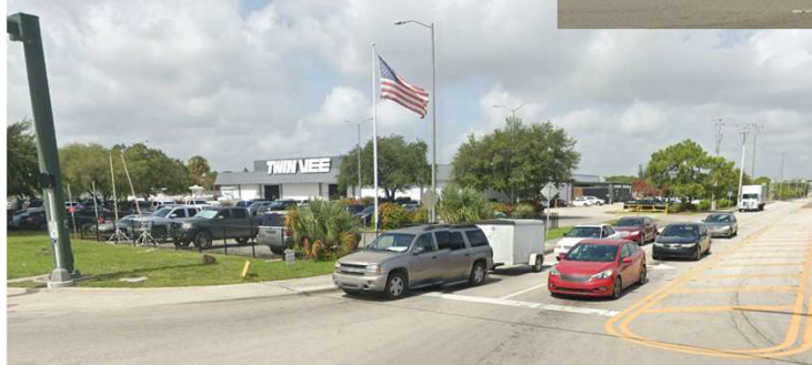
TWIN VEE – SITE PLAN & DESIGN REVIEW