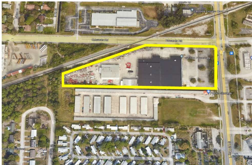
SITE AREA +/- 7.27 Acres