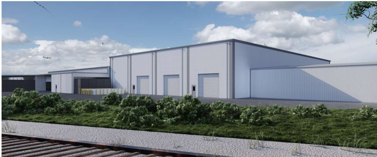
TWIN VEE – SITE PLAN & DESIGN REVIEW