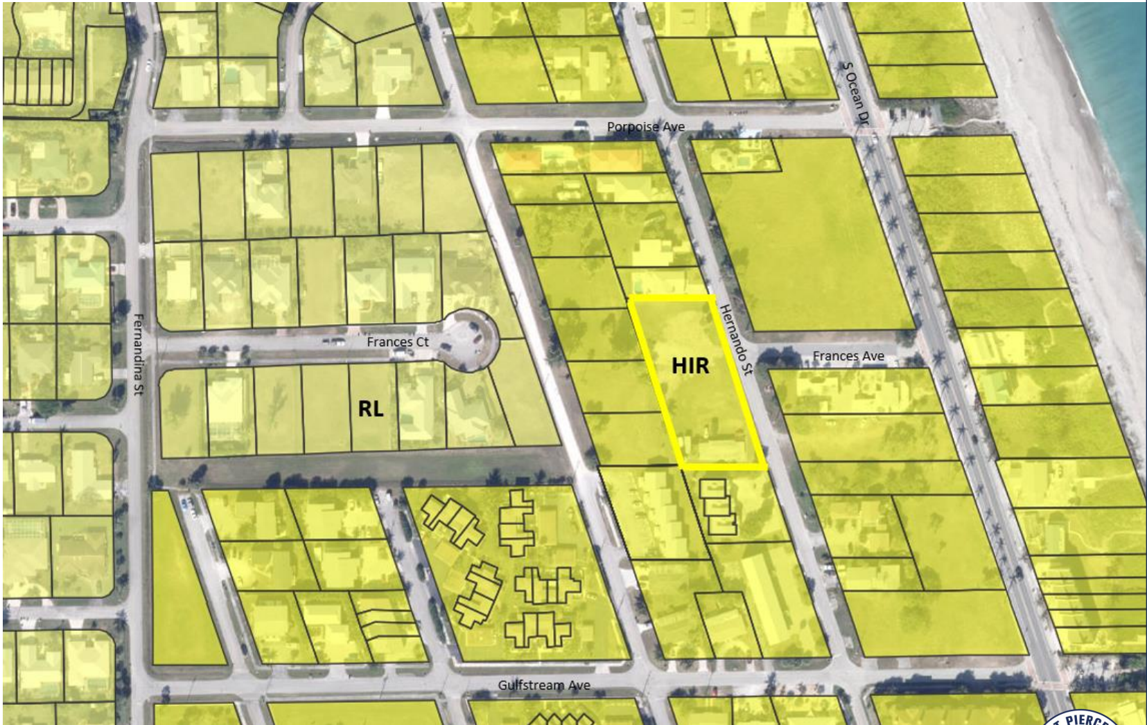
Hernando Final Plat – 601 Hernando Street

Current FLU: HIR, Hutchinson Island Residential