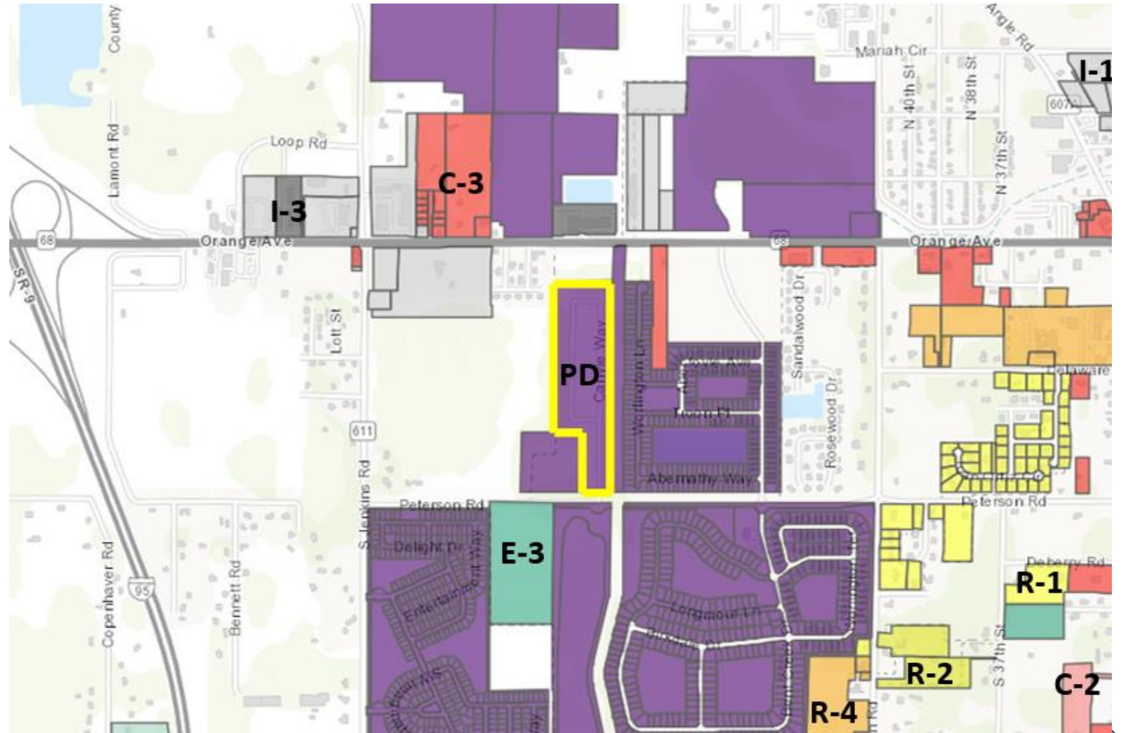
Bent Creek Parcel C Final Plat – 5000 Peterson Road

Currently Zoned: PD, Planned Development