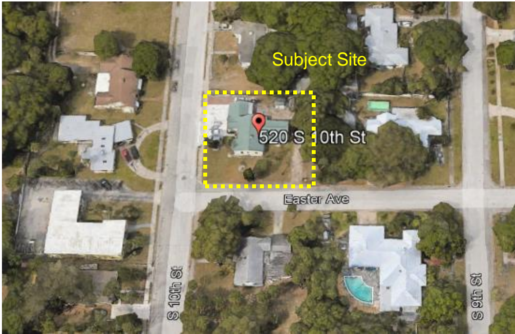
SUBJECT PROPERTY/AERIAL VIEW