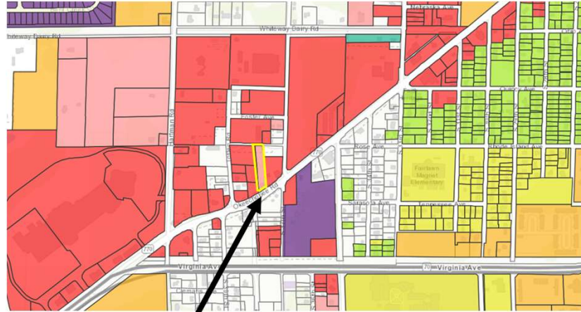
Florida Barn– Rezoning – 3720 Okeechobee Road

Proposed Zoning: C-3, General Commercial