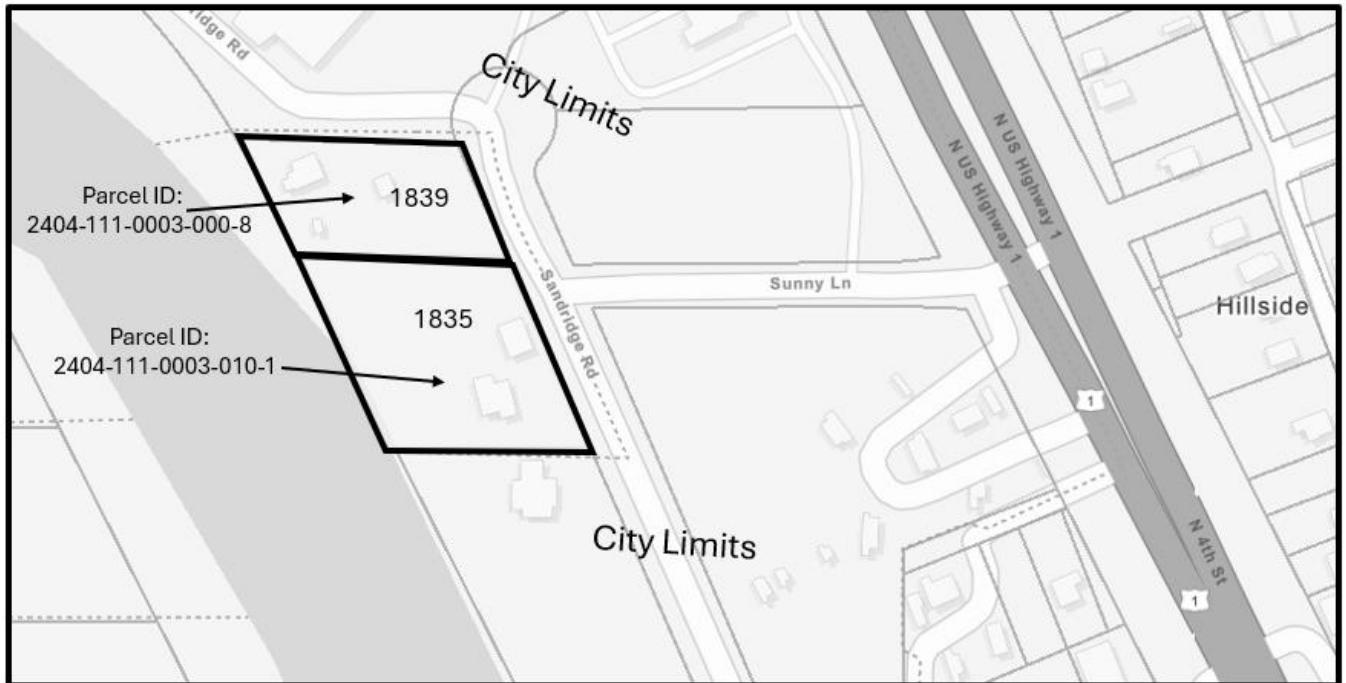
EXHIBIT A Territorial Limits Extension