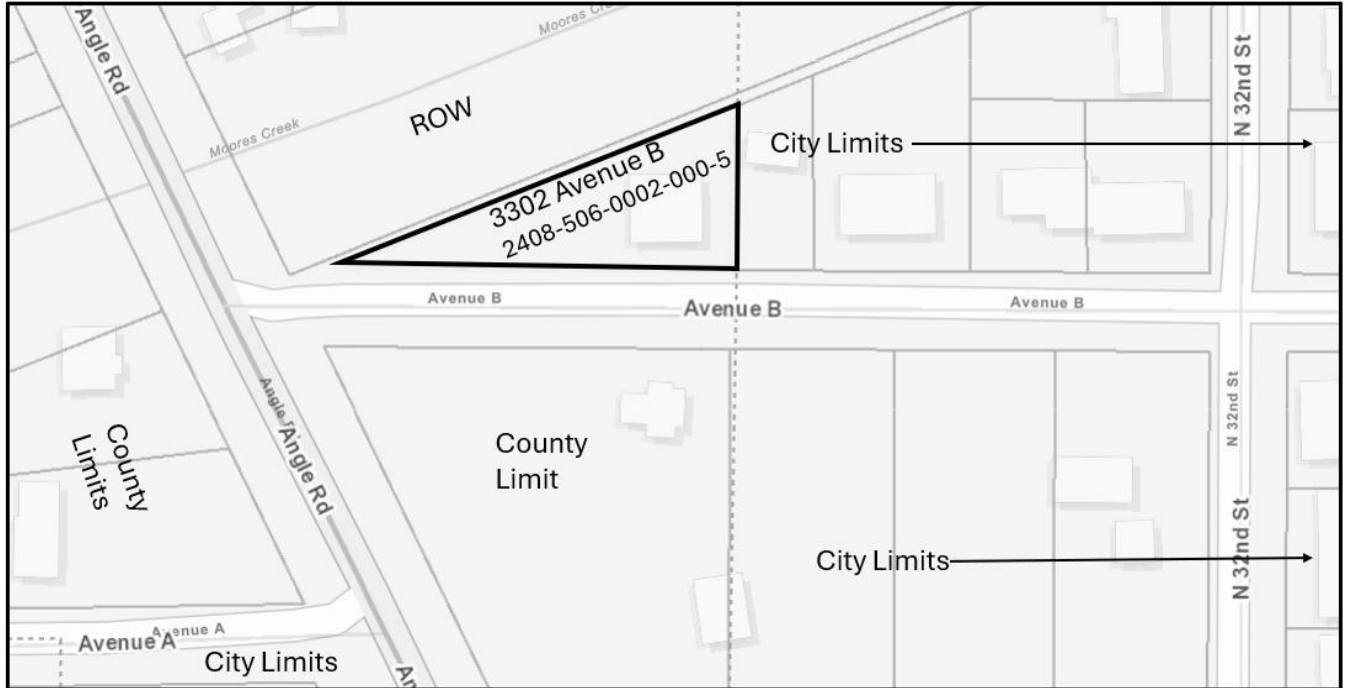
EXHIBIT A Territorial Limits Extension