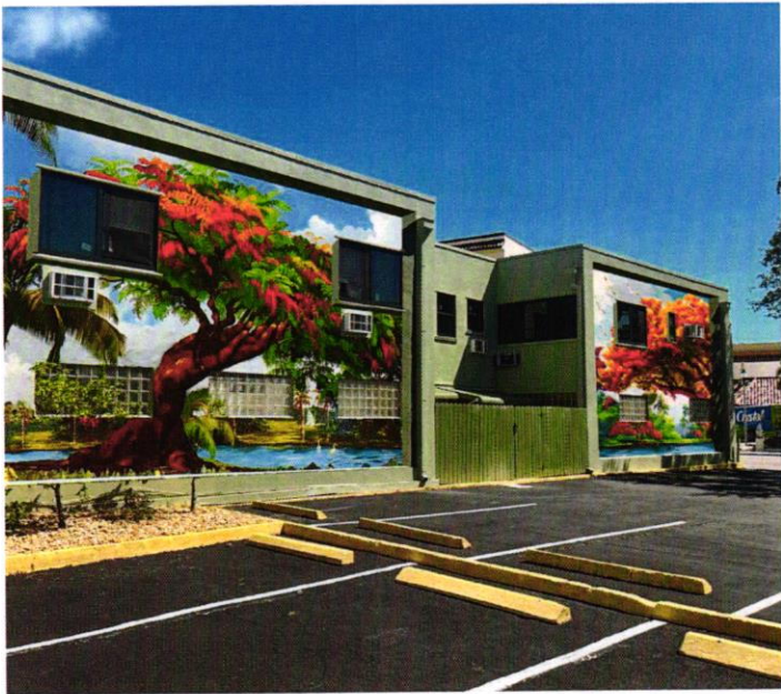
Exhibit A Poinciana's Hand