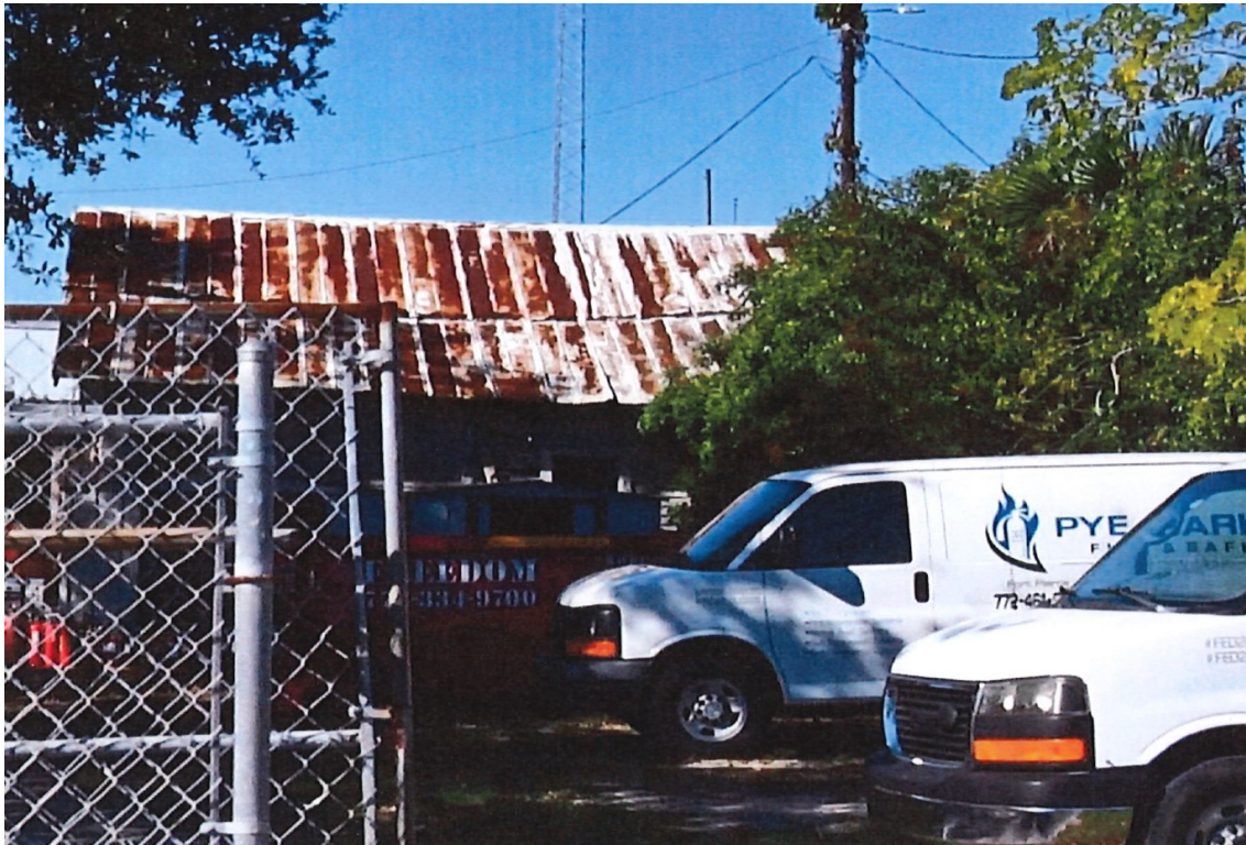
EXTERIOR DAMAGE OF THE STRUCTURE