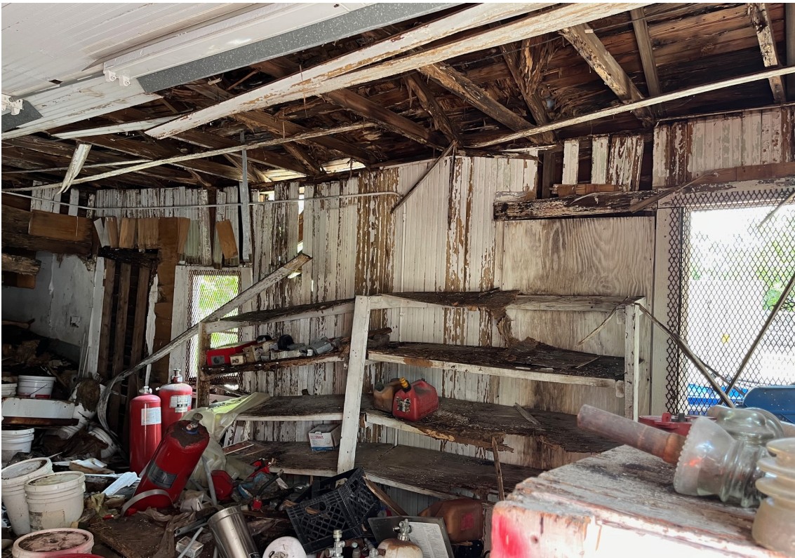
INTERIOR DAMAGE OF THE STRUCTURE